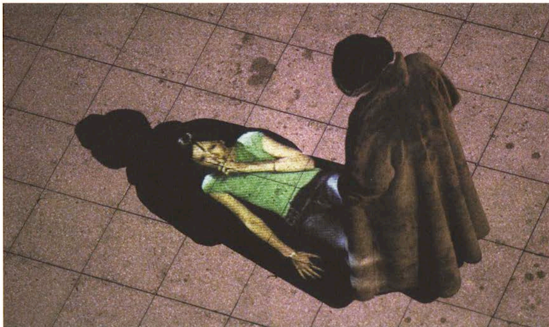
Left: Under Scan by Rafael Lozano-Hemmer. Installation at Lincoln University, November 2005.

Under Scan was a £750,000 investment from emda to celebrate Cultural Quarters across the East Midlands. The project was also financially supported by Arts Council England and Three Cities Create and Connect.