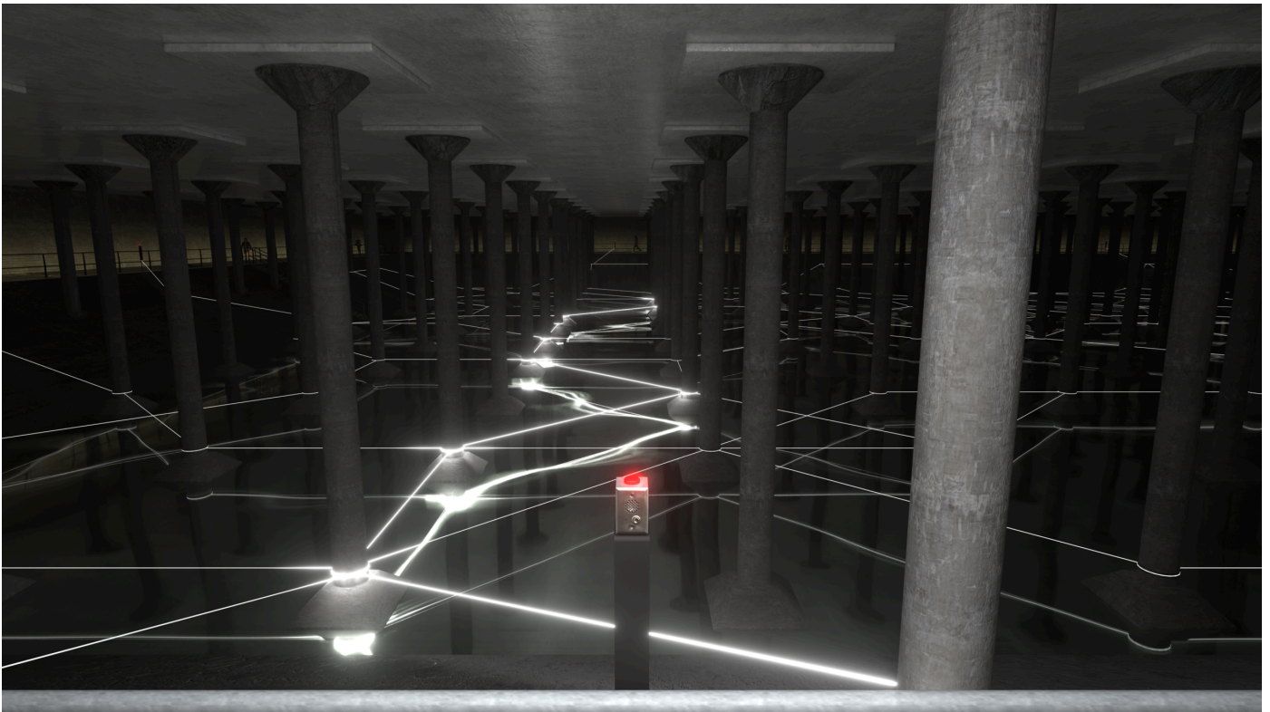
The otherworldly installation “Undercurrents” by Rafael Lozano-Hemmer opens at the Buffalo Bayou Park Cistern, a former reservoir in Houston.

The sequences begin to move from there. “Then these light sequences start flashing, emitting from the location where you spoke,” he says. “They bounce around until they find one of the other eight intercoms, at which point you hear the person on the other side.”