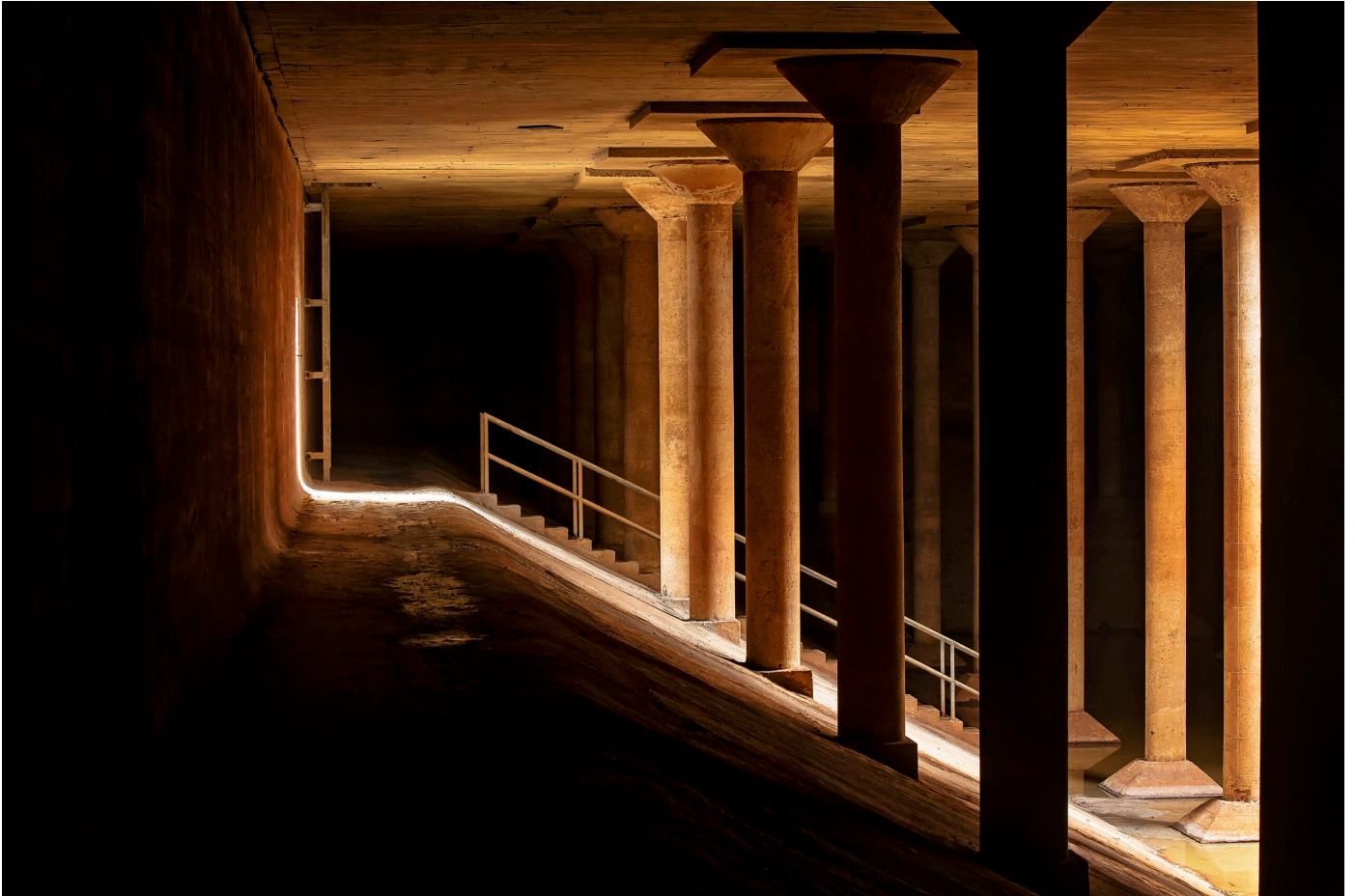
The new installation “Undercurrents” by Rafael Lozano-Hemmer translates voice into a composition of illumination.

Lozano-Hemmer, known for large-scale interactive works that translate biometric data, voice and presence into light and sound, approaches the Cistern as both a physical and civic organism. The Montreal-based multimedia artist creates works that depend on participation.