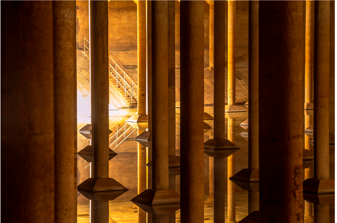
Light streams through the Buffalo Bayou Park Cistern’s 221 columns in Rafael Lozano-Hemmer’s “Undercurrents.”

“You can photograph it, but you can’t truly capture it,” Farber says. “You have to experience it in person.”