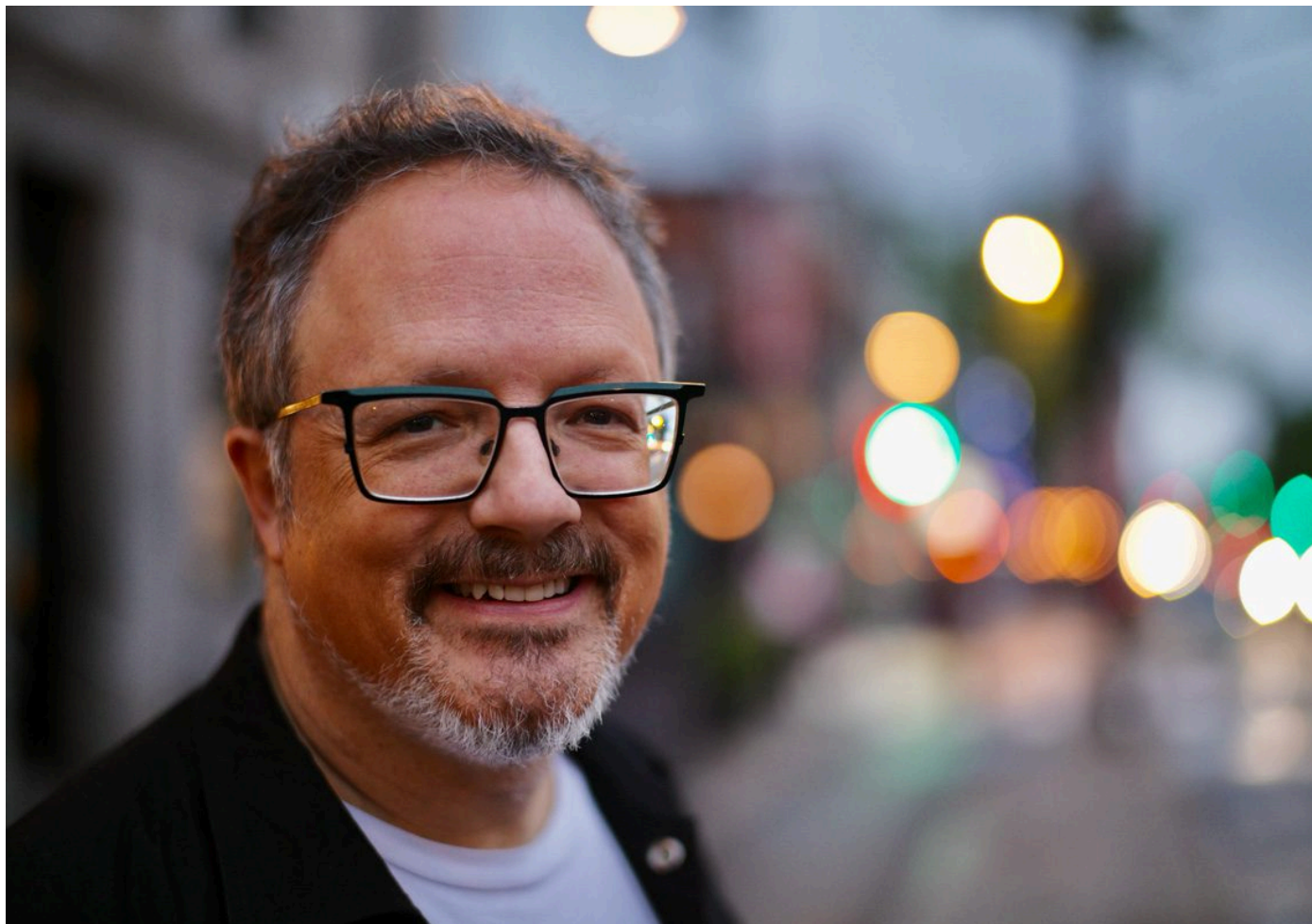
Artist Rafael Lozano-Hemmer.

In a moment saturated with broadcast and opinion, “Undercurrents” turns toward active, relational listening.