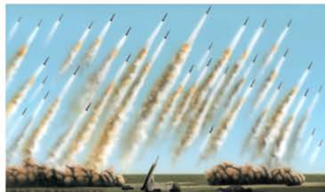
Oliver Laric, Versions (Missile Variations) (detail), 2010, airbrushed paint on aluminum composite board in 10 parts, 9 7/8" x 17 3/4".

Given the breakneck pace of technological evolution, the soft- and hardware tools employed by artists are often outmoded almost as soon as the works are created. (E.A.T. performances, such as Frank Stella and Mimi Kanarek playing tennis with racquets fitted with contact microphones that switched lights on and off on impact with the ball, for example, now seem strangely clunky, though the works were radical for their time.)