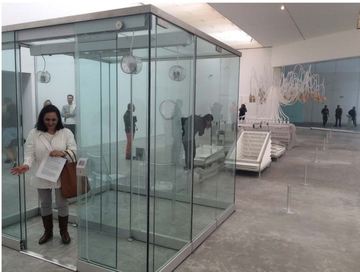
Installation view of ‘Rafael Lozano-Hemmer: Pseudomatisms’ at the Museo Universitario Arte Contemporáneo (MUAC)

Pseudomatisms has its own memory, too, with large evolving databases and hard drives that record and reproduce images of the visitors. Each piece represents an enormous engineering challenge and the artist is quick to point out that the work is made possible by a multifaceted team of makers and thinkers. Additionally, in the interest of participation, all of the code and software created for the exhibition was made publicly available in open source formats and the bilingual show catalogue is available as a free download on the museum’s website. Being “open source” is key to the Mexican-born, Canadian-raised artist’s work. Not only is the work participatory, but the artist’s hand is completely absent. Furthermore, the work almost always necessitates outside sources, from statistics to live video. Many of the pieces function as input-output machines, or feedback loops.