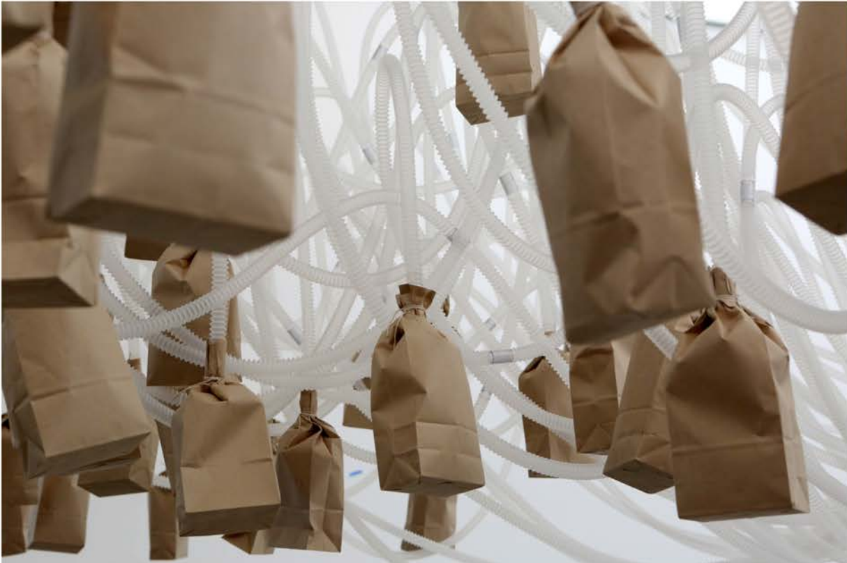
Rafael Lozano-Hemmer, "Vicious Circular Breathing" (2013)

installation stretches the length of the gallery, resembling a giant squid robot. Tentacle-like tubes stretch from a large hermetically sealed chamber, where viewers are invited to breathe the same air as everyone who has experienced the work before them. In theory, that means people who enter the glass room, through a decompression chamber, share all of their bacteria and viruses with every other person who has occupied the space. Complete with asphyxiation and panic warnings, there is a cold, medical formality to the work, which makes walking into the chamber a little intimidating. It's as if the machine were trying to mimic or create a panic attack by breathing through the paper bags, which inflate and deflate at the same rate as the average human, around 10,000 cycles per day. In the show catalogue, Lozano-Hemmer cited Marina Abramović and Ulay's 1977 performance work " Breathing In / Breathing Out (Death Itself) ," Marcel Duchamp's " 50 cc of Paris Air " (1919), among others, as inspiration.