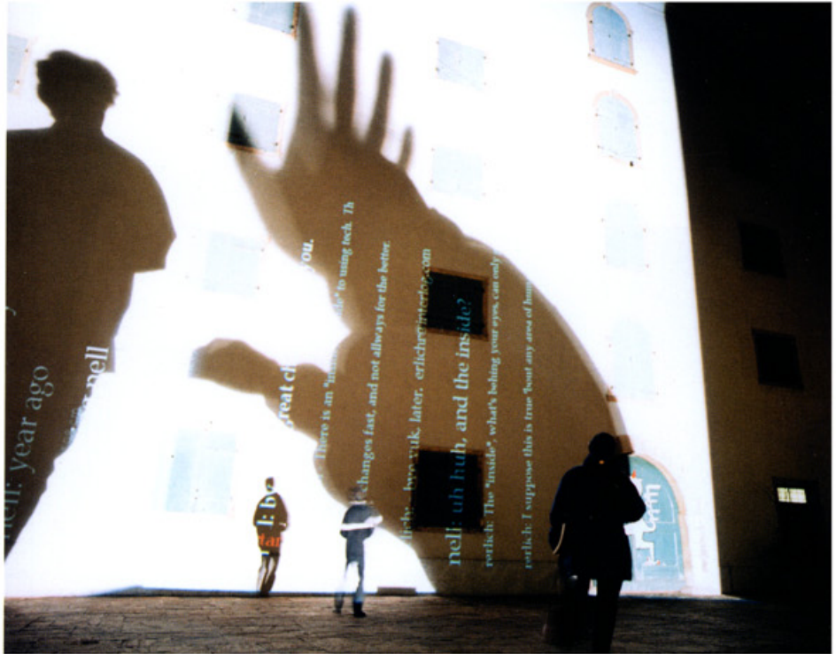
Rafael Lozano-Hemmer. Re: Posición del Miedo. Arquitectura Relacional 3, 1997. Bial de Arquitectura y Media, Graz, Austria