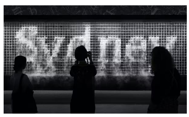
Atmospheric Memory by Rafael Lozano-Hemmer, Cloud Display (2019).

On the walls and floor of the main exhibition room, there are projected outsize images – a moving feast of text and data. These images and data represent the chaos of the digital world and the ubiquity of digital tracking technologies in urban environments.