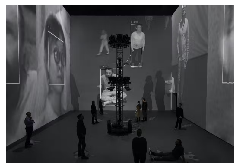
Atmospheric Memory by Rafael Lozano-Hemmer, Zoom Pavilion.