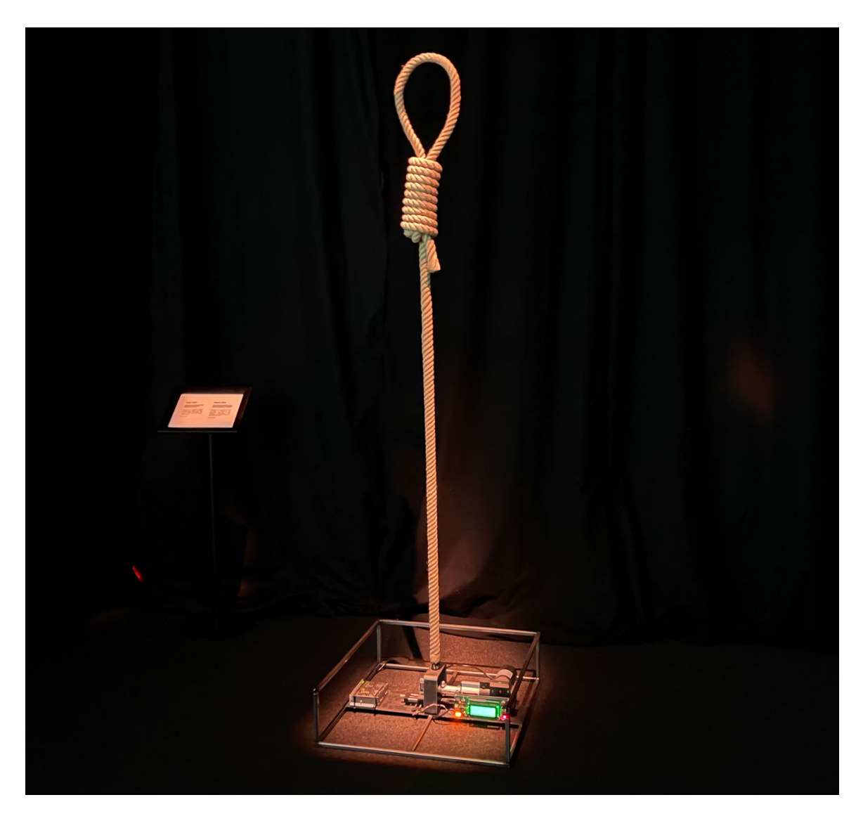
"Sway" (2016).

The exhibition wasn't all light and lights, however — one piece, Sway (2016), is an adult-sized upside-down noose that ever-so-slightly oscillates from side to side every three to four minutes — representing every time ICE arrests someone.