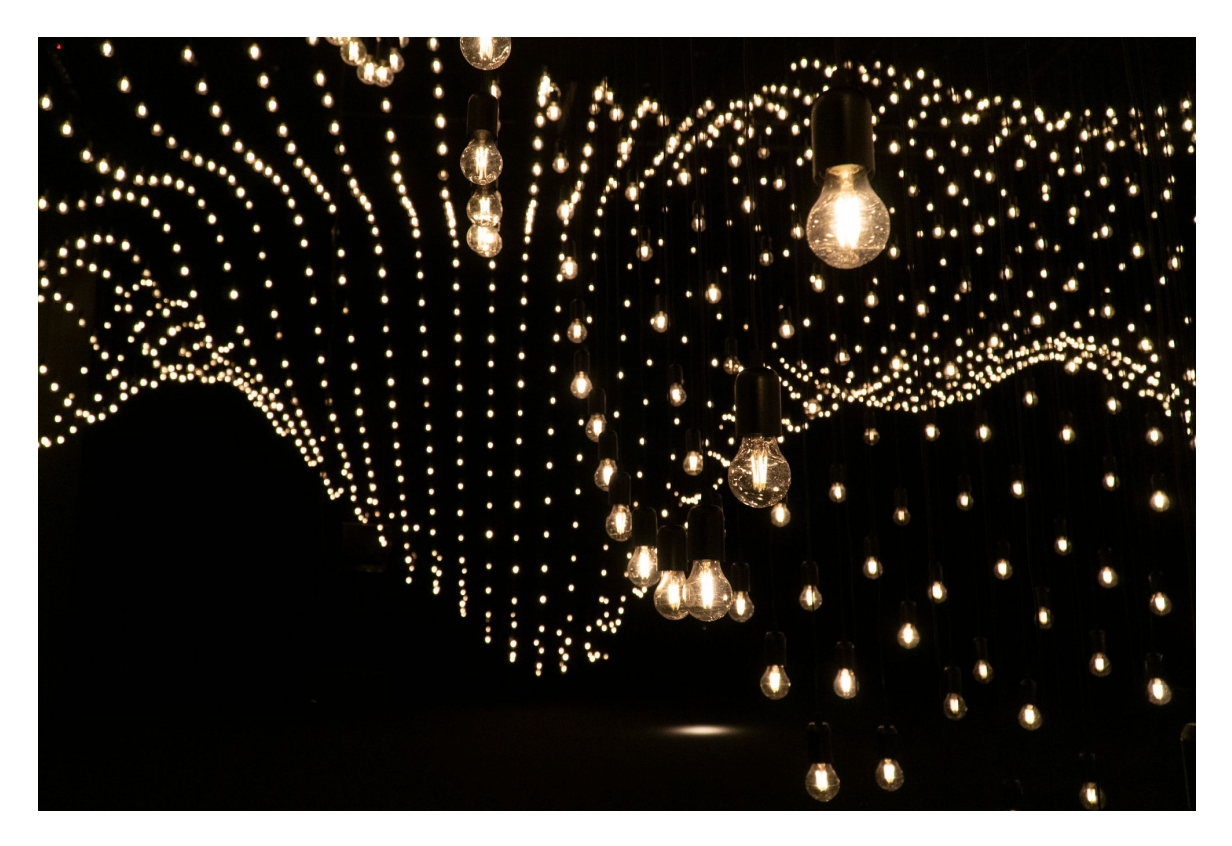
"Pulse Topology" (2021).

As a retrospective, the work exhibited spans about two decades and includes the premieres of some standout pieces. The participatory "Pulse Topology" (2021), where 3,000 dangling LED lights blink the varying rhythms of visitors' recorded heartbeats, had its West Coast premiere in the main hall of Gray Area — looking like an otherworldly pulsing starry sky over TECHS-MECHS' opening night audience.