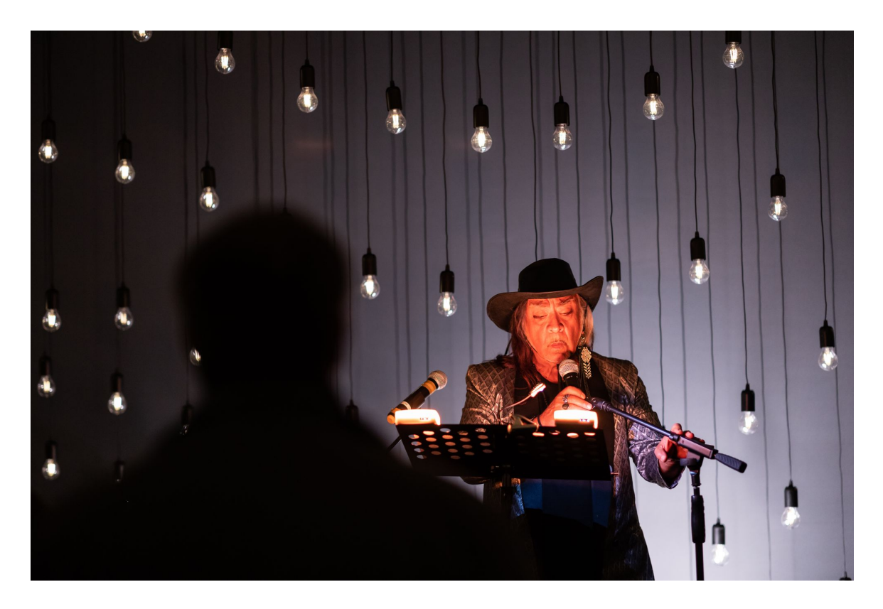
Guillermo Gómez-Peña.

The opening night also featured the poetry of Mission neighborhood native and anti-border activist, Guillermo Gómez-Peña, in a provocative and often humorous Spanglish performance. Some of his meta-commentary: "The artist can always find useless aesthetic, poetic, political, erotic, ritual and playful functions for an otherwise dehumanizing machine. This is the case of Mexi-Canadian artist Rafael Lozano-Hemmer."