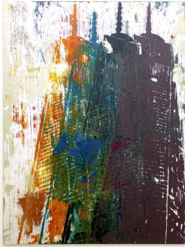
Enoc Perez, One World Trade Center , 2015.