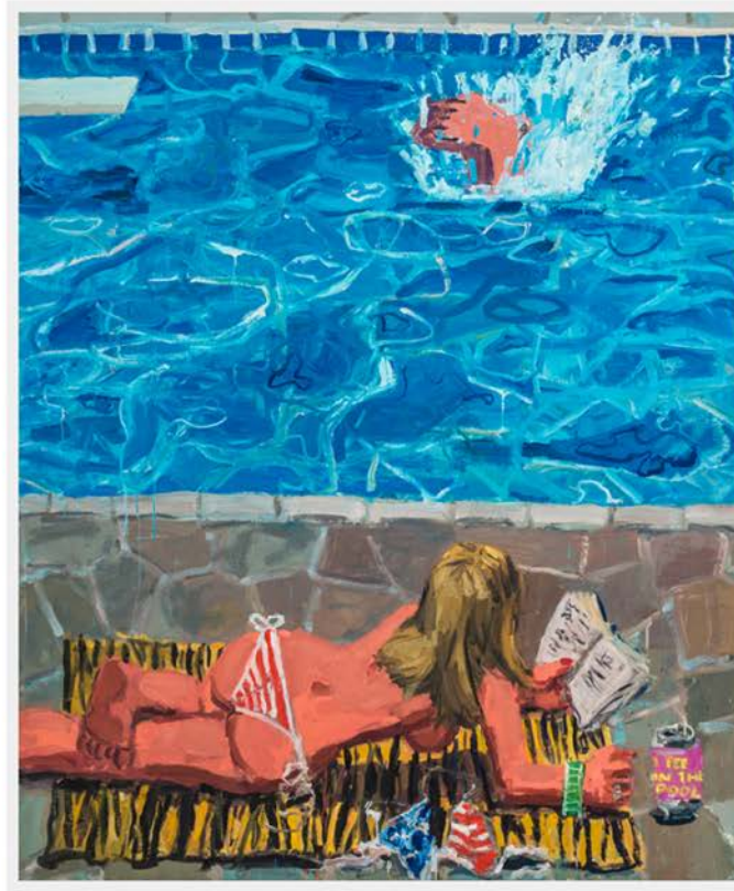
Todd Bienvenu, Adult Swim , 2015, Photo: Courtesy Life on Mars.