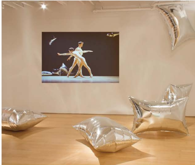
Installation view, "Where Sculpture and Dance Meet," 2015.