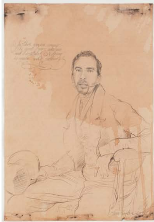
Taner Ceylan, Self Portrait 9 , 2015.