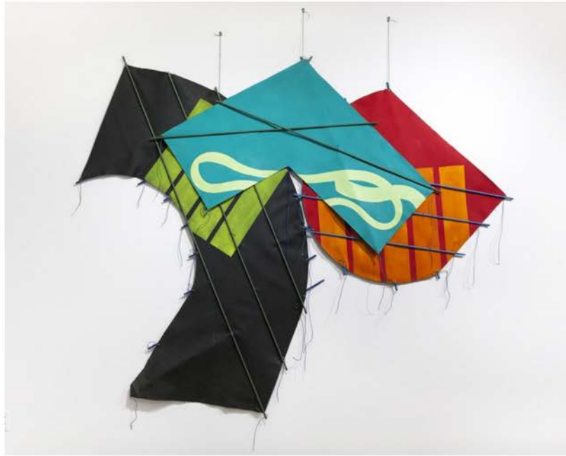
Richard Smith, Mask, 1983