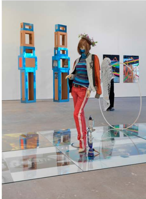
Installation view, Isa Genzken, 2015.

One of the most fascinating pieces here, Please Empty Your Pockets (2010), encompasses a white conveyor belt rigged with computerized scanners, similar to those at airport check points. Visitors are invited to empty their pockets and place the items on the belt. After passing through the scanner, the items can be removed from the belt. A digital image doppelganger of each piece, preserved for posterity, appears on the spot where the item had just been placed. In this exhilarating yet chilling work, as in many pieces on view, Lozano-Hemmer warns of new possibilities for technology's ever-evolving invasiveness.