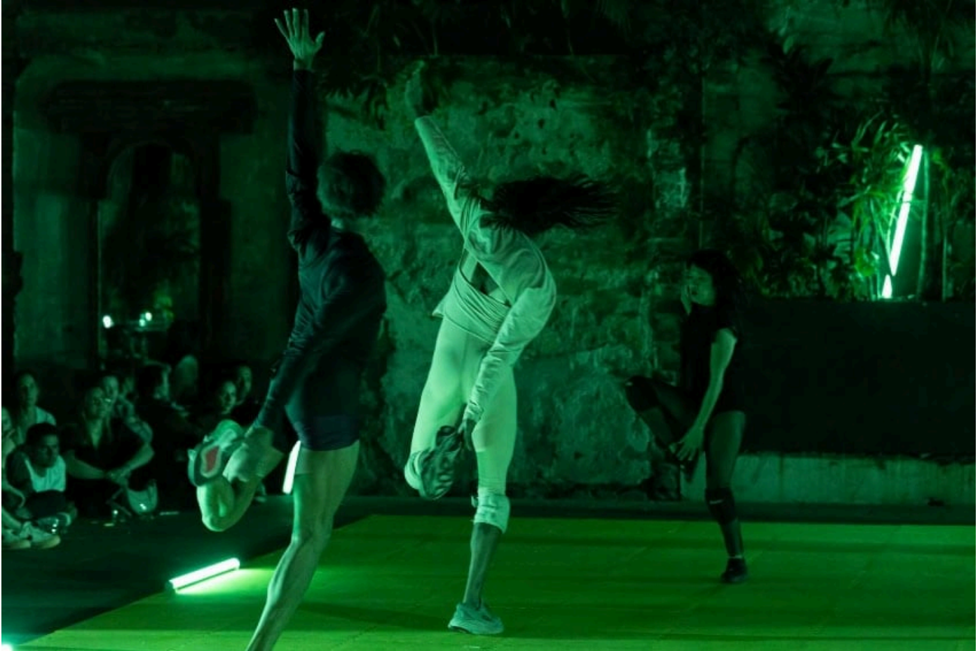
TONO explores time as part of artworks in experimental forms.