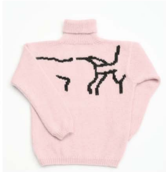
SWEATERS FROM SERIES "THE HAIR SUCKS SWEATER SHOP", 2015