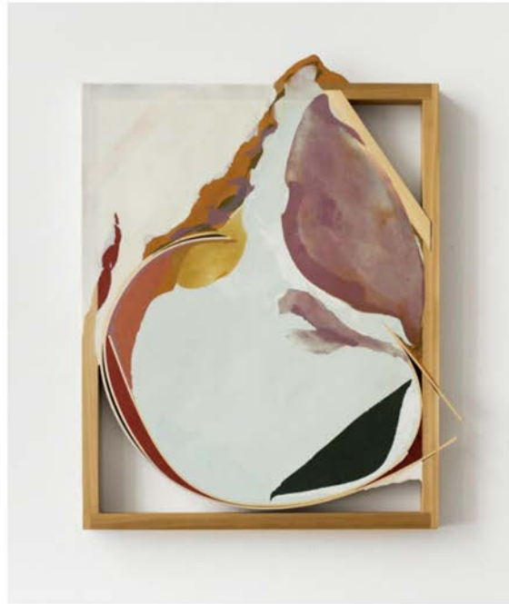
COMPOUND FLAT #41, 2013. AND COMPOUND FLAT #34, 2013.

Maychack's wall pieces are objects that inhabit the space between sculpture and painting; in eradicating yet emphasizing the distinction between the two, Maychack enables his pieces to hover in a state of indeterminacy and paradox. The suggestion of functionality is present, yet stripped of decisive purpose. These are works that question our ability to navigate the continuum between a functional physical space and abstract pictorial space, while supplying a new framework for a visual field. In his new body of work, Maychack exposes stripped-down forms, devoid of metaphors. This continuation of his Compound Flat series delves more deeply into the lexicon of painting through the construction of wall objects. In these pieces (constructed of epoxy clay, pigment, and wood), surfaces become places where physical and sculptural, abstract and pictorial space, intersect.