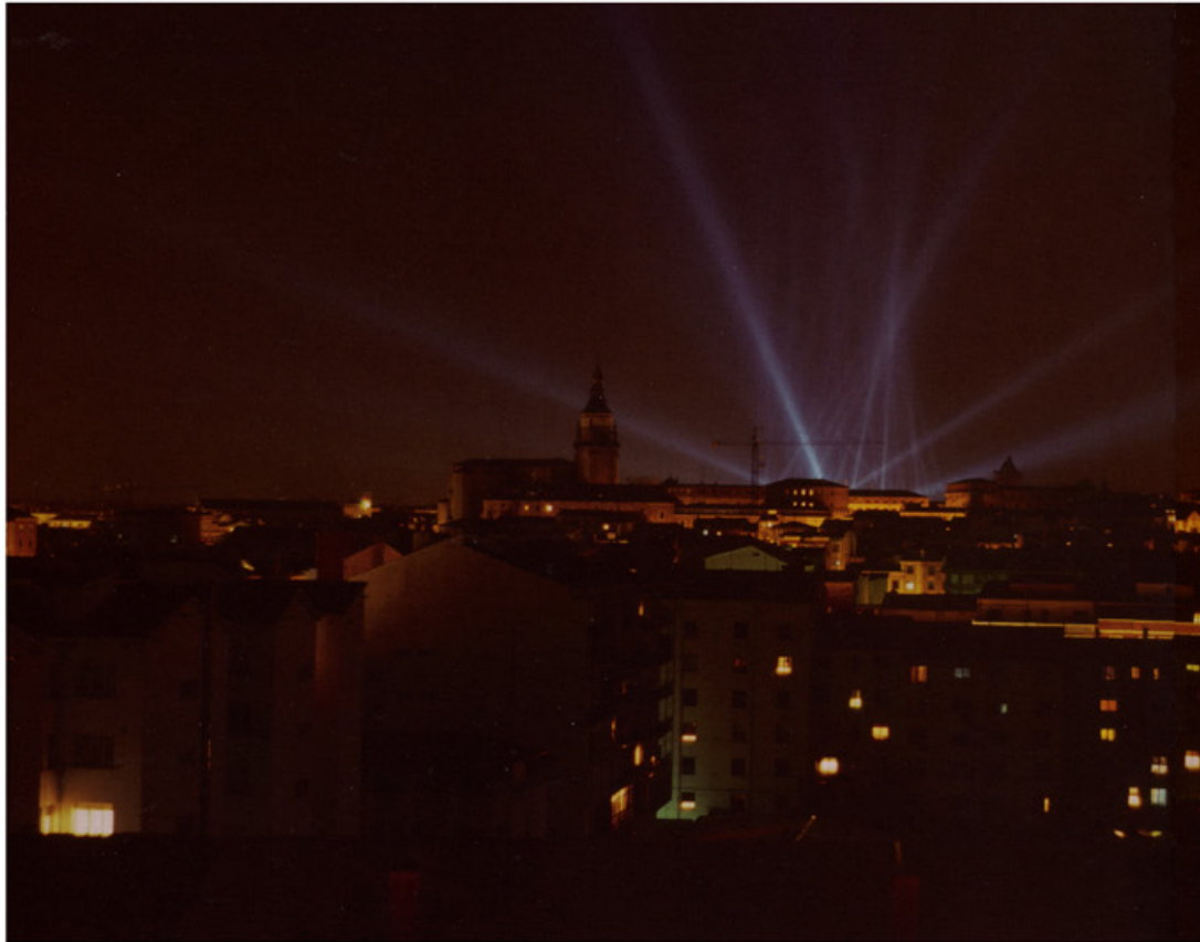
RAFAEL LOZANO-HEMMER Vectorial Elevation, Relational Architecture 4 , 2002 live webcast; version for the Basque City of Vitoria-Gasteiz and www.alzado.net ; photograph by David Quintas