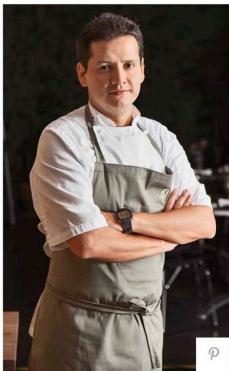
CHEF JORGE VALLEJO OF THE FAMED QUINTONIL

I was lucky enough to get a reservation, too, at Quintonil , a relaxed, chic temple to vegetables and herbs, many of them grown in the restaurant's garden. Chef Jorge Vallejo is inspired, as was my second helping of insects: an avocado tartare with escamoles (ant larvae, or, more aspirationally, insect caviar—an Aztec delicacy), topped with a dusting of onion ashes and dried seaweed. I am now down with eating bugs.