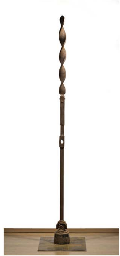
Beverly Pepper Guardian Messenger, 1983

Diane Arbus, Brenda Diana Duff Frazier, 1938 Debutante of the Year, At Home, 1966