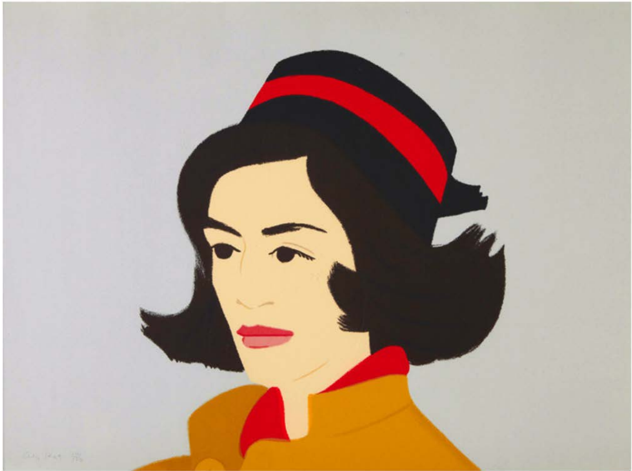
Alex Katz Ada in Hat (from Alex & Ada portfolio) , 1990 Nikola Rukaj Gallery