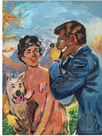
Jacques Flechemuller Je Vous Aime Beaucoup #2 , 2015 The Good Luck Gallery