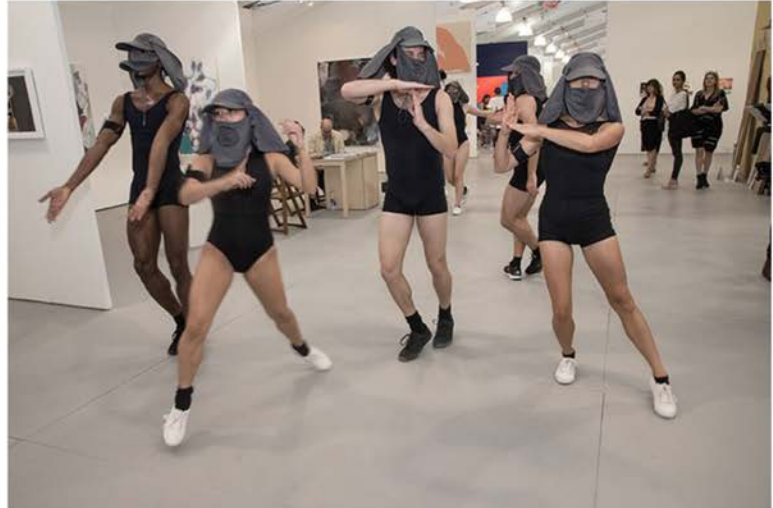
Nina Chanel Abney, Untitled (XXXXXX) , 2015. Madeline Hollander, MILE , 2015, part of UNTITLED. , performances.