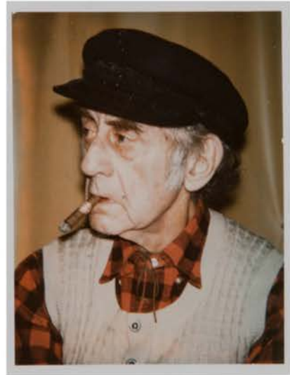
Lucy Mackenzie, Striped Cup and Paper Bag , 2012. Andy Warhol, "Man Ray" 05.08416, 1973.