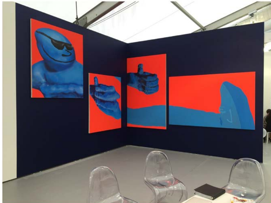
Austin Lee Thumbs Up , 2015 Postmasters Gallery $65,000