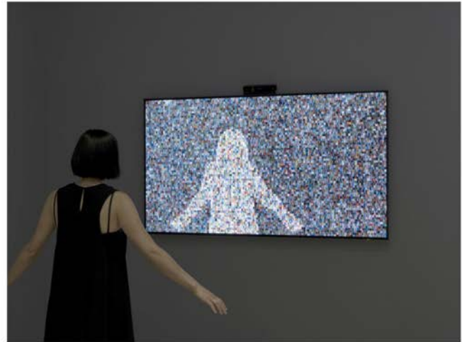
Rafael Lozano-Hemmer 1984x1984 , 2014 bitforms gallery