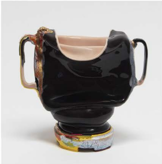
Kathy Butterly tangsome , 2015 Tibor de Nagy $18,000