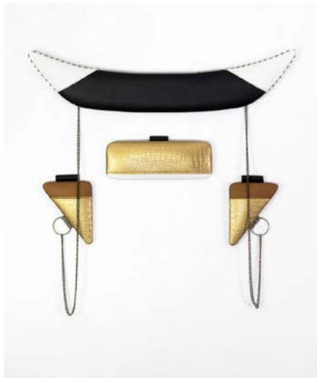
Trish Tillman Dawn Upon , 2015 Asya Geisberg Gallery $2,500 - 5,000

Amid all this big, bold work, don't miss UNTITLED.'s smaller wares. São Paulo-based Nino Cais's collages and photographs particularly stood out. An obsessive collector of dollar-store items, small decorative doodads, and books of all kinds, Cais layers selections from his trove in uncanny, often performative combinations. After perusing the fair, take a break in the Maurizio Cattelan- and Pierpaolo Ferrari-conceived lounge, a delightfully surrealist environment covered in carpets, wall hangings, oversized objects, and mirrors.