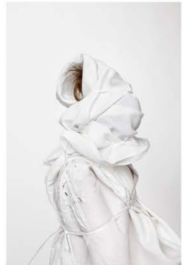
Mariu Palacios Serie "heroína en construcción" , 2015 Cecilia Gonzalez Arte Contemporaneo