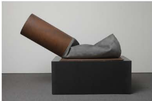
Claes Oldenburg Fagend Study , 1975 Omer Tiroche Contemporary Art