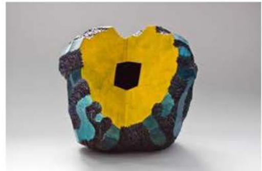
Ken Price Untitled , 1993 James Barron Art