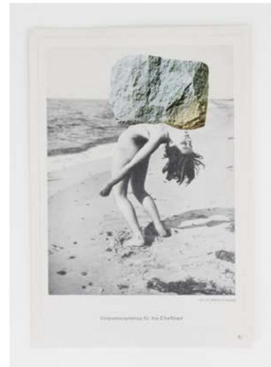
Nino Cais Untitled , from the Women and rocks Series , 2014 Central Galeria de Arte