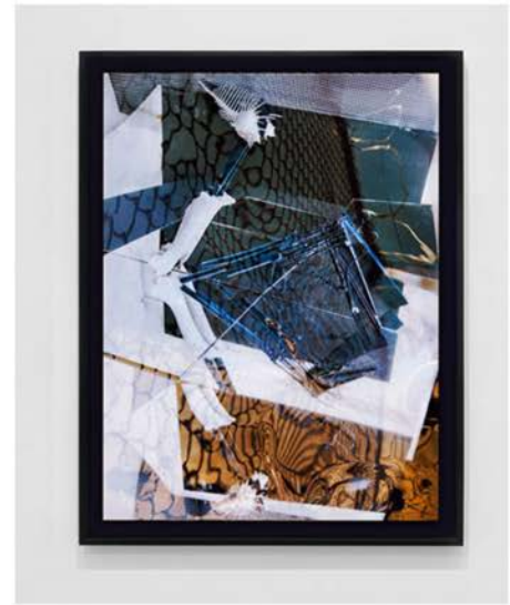
Agathe Snow, Since the Beginning of Time... Love is a Battlefield, 2015. Willa Nasatir, Crime #7 (Gun), 2015.