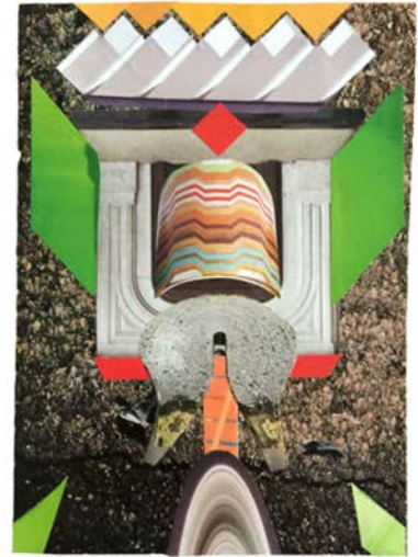
Sara Cwynar, Pencils , 2015. Image courtesy of Cooper Cole; Dona Nelson, Coins in a Fountain , 2015. Image courtesy of Thomas Erben; Elisabeth Wild, Untitled , 2015. Image courtesy of Proyectos Ultravioleta.