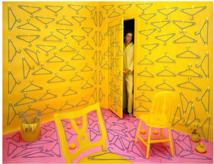
Sandy Skoglund Hangers, 1979