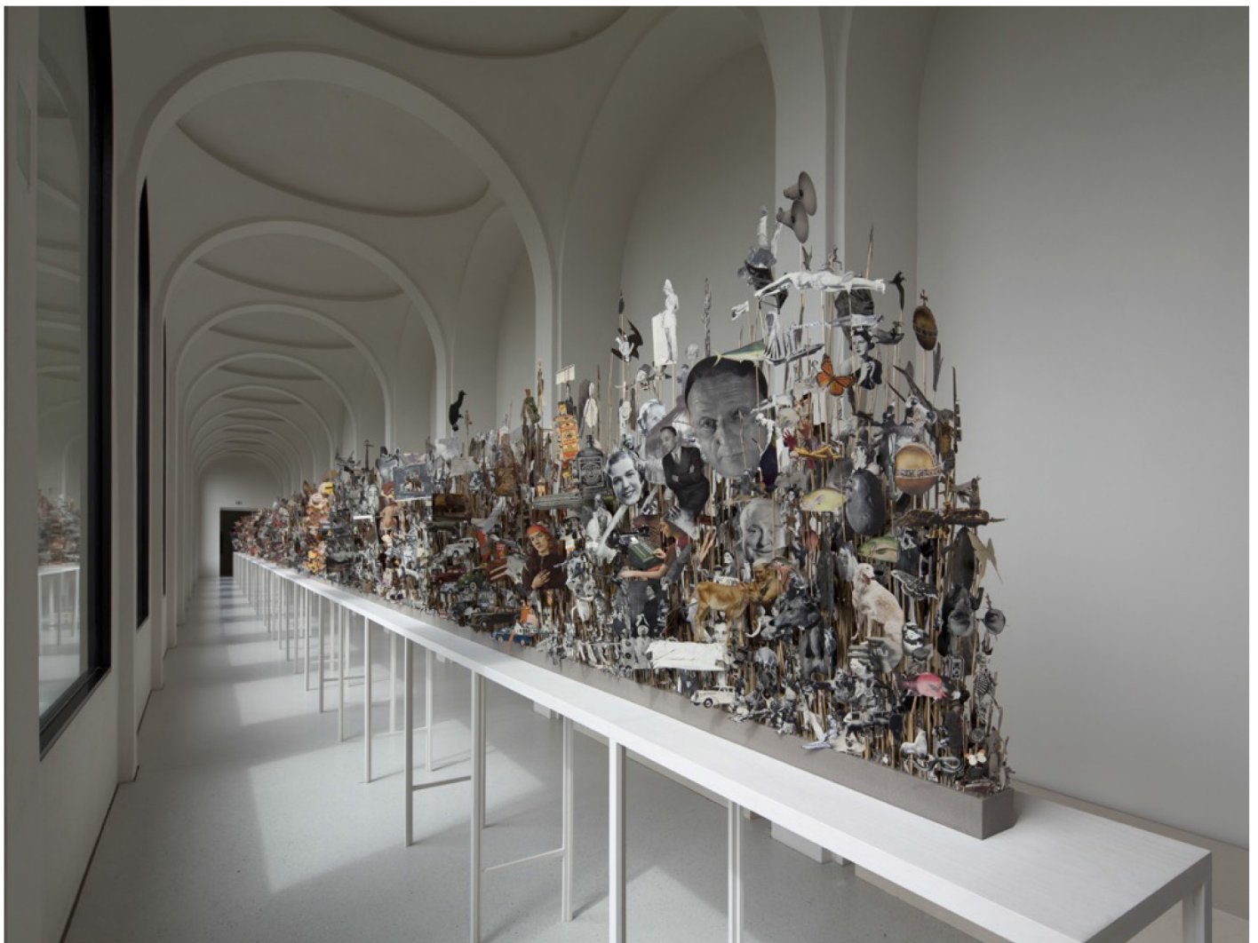
Leaves of Grass, by Geoffrey Farmer, at the National Gallery of Canada.

Leaves of Grass, by Geoffrey Farmer, National Gallery, October: Farmer's epic installation is the high point in Shine A Light, the National Gallery's biennial of recent, Canadian contemporary acquisitions. Farmer's crew clipped thousands of images from decades of Life magazine, and propped up the images on small sticks. Walk its length and a half-century of history and popular culture marches past, like a veritable parade of memory. Click here to read a review of Shine A Light. (http://ottawacitizen.com/entertainment/local-arts/the-national-gallery-shows-off-some-of-its-recent-purchases)