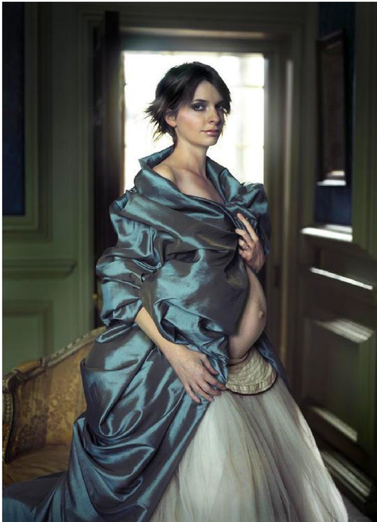
Portrait of Catrin Finch, by Edith Maybin, at Wall Space Gallery in Westboro.

Portrait of Catrin Finch, by Edith Maybin, Wall Space Gallery, July: The exhibition of emerging photographers at the Westboro gallery had much to choose from, and the jewel at the centre was Edith Maybin's sumptuous portrait of the very-pregnant Welsh harpist Catrin Finch. That sublime expression, that rich taffeta, that expansive belly — it's a photograph that commands respect. Click here to read more about the emerging photographers exhibition.