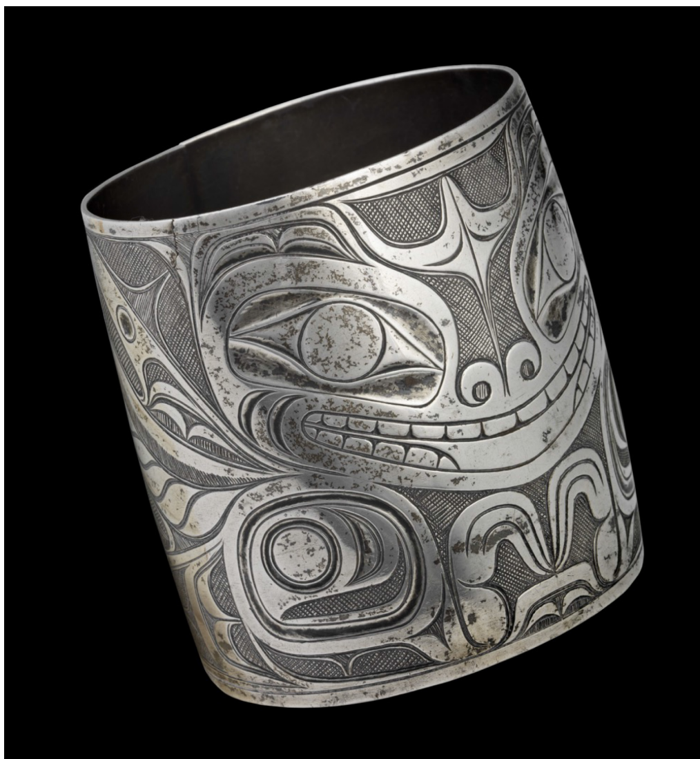
The Sea-Bear Bracelet, by Charles Edenshaw, at the National Gallery of Canada

Read more about all these works and exhibitions at