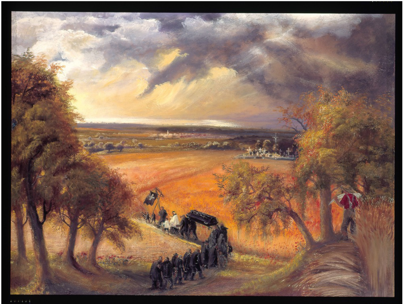
Otto Dix, Cemetery (Funeral Procession through Summer Landscape), 1941

they are dada-esque, and delightful proof that art can come from anyone. Click here to read more about Beck and the New Artist Showcase. ( http://ottawacitizen.com/entertainment/music/new-artists-a-refreshing-change-from-stodgy-establishment-saw-gallery )