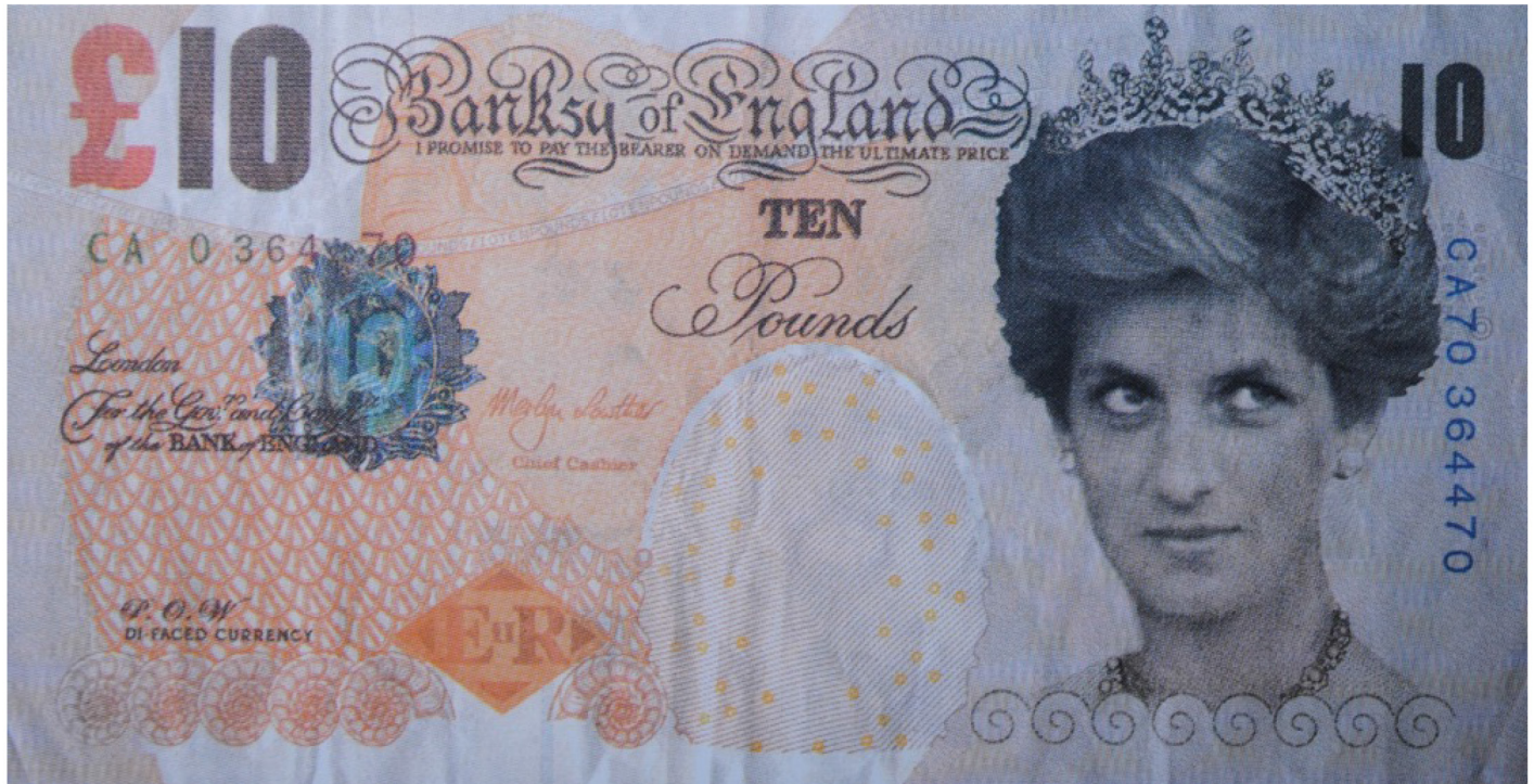
A fake 10-pound note by Banksy. Soon after he made his fake, more fakes of his fake were available on eBay, and all worth more than a real 10-pound note.

countryside — with storm clouds once again threatening the motherland and a farmer at the roadside with the reaper’s scythe — was powerful mix of natural beauty and man-made terror. Click here to read more about Dix and Jackson. (http://ottawacitizen.com/entertainment/local-reviews/otto-dix-and-a-y-jackson-two-men-two-nations-and-one-unforgettably-horrible-war)