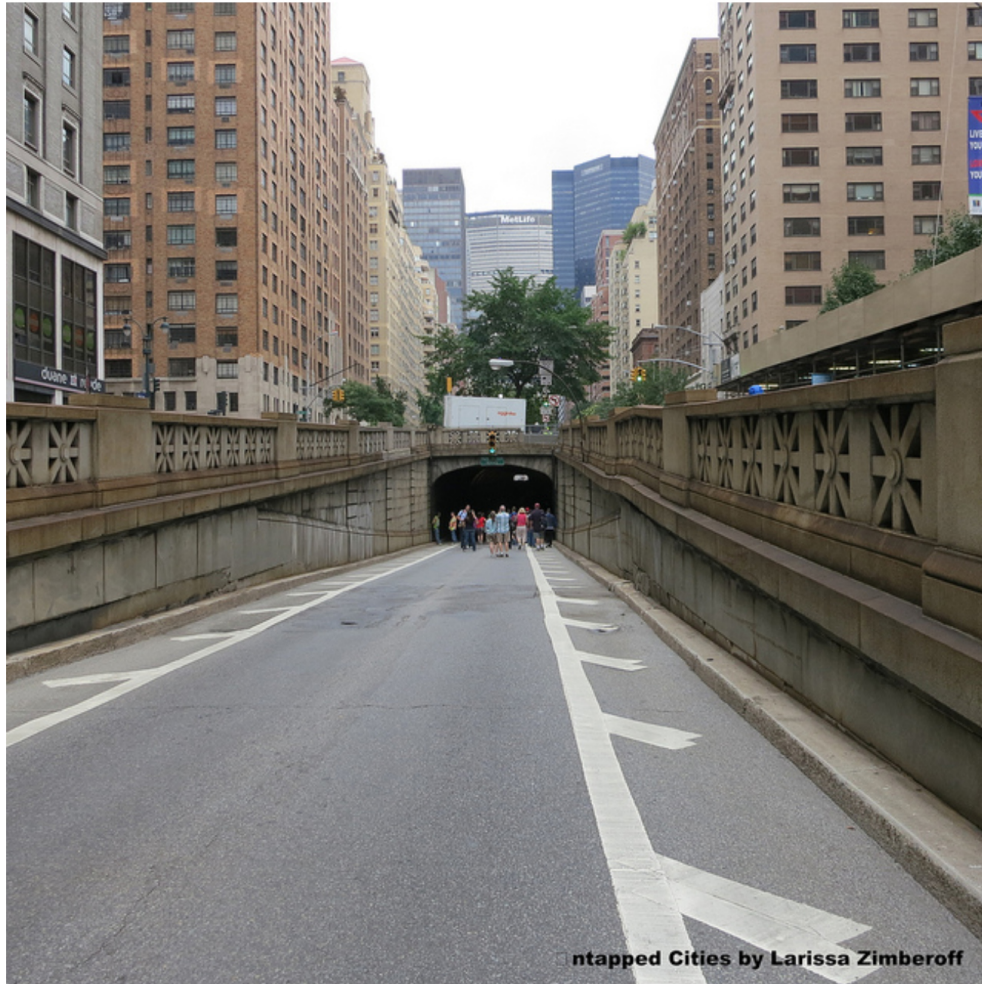
The entrance to the Park Avenue Tunnel at 33rd Street.