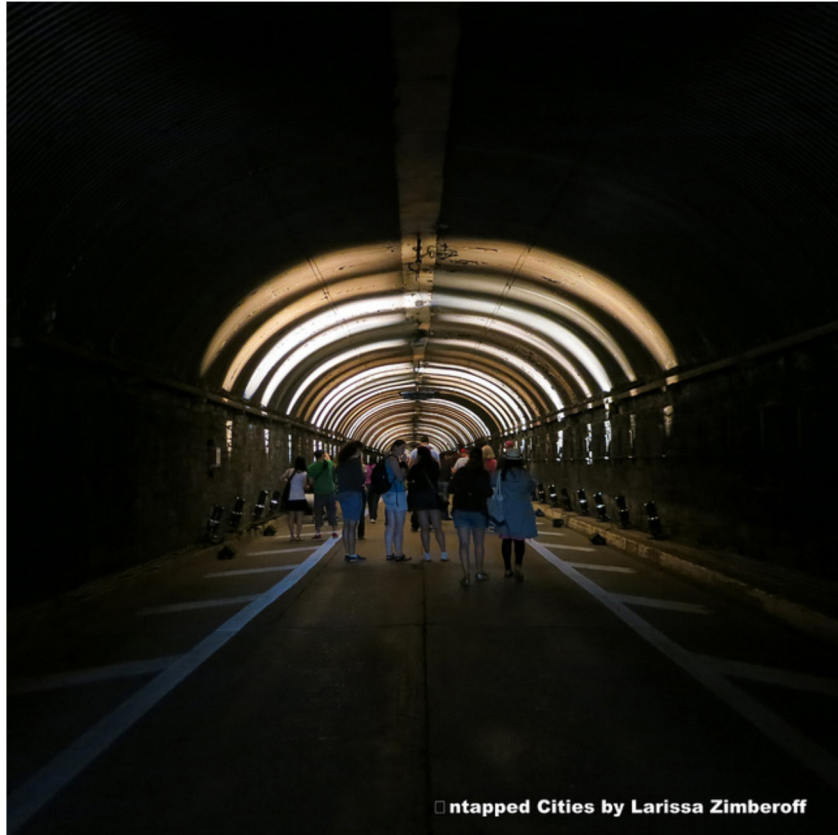
Lights fan out from the center of the Voice Tunnel.