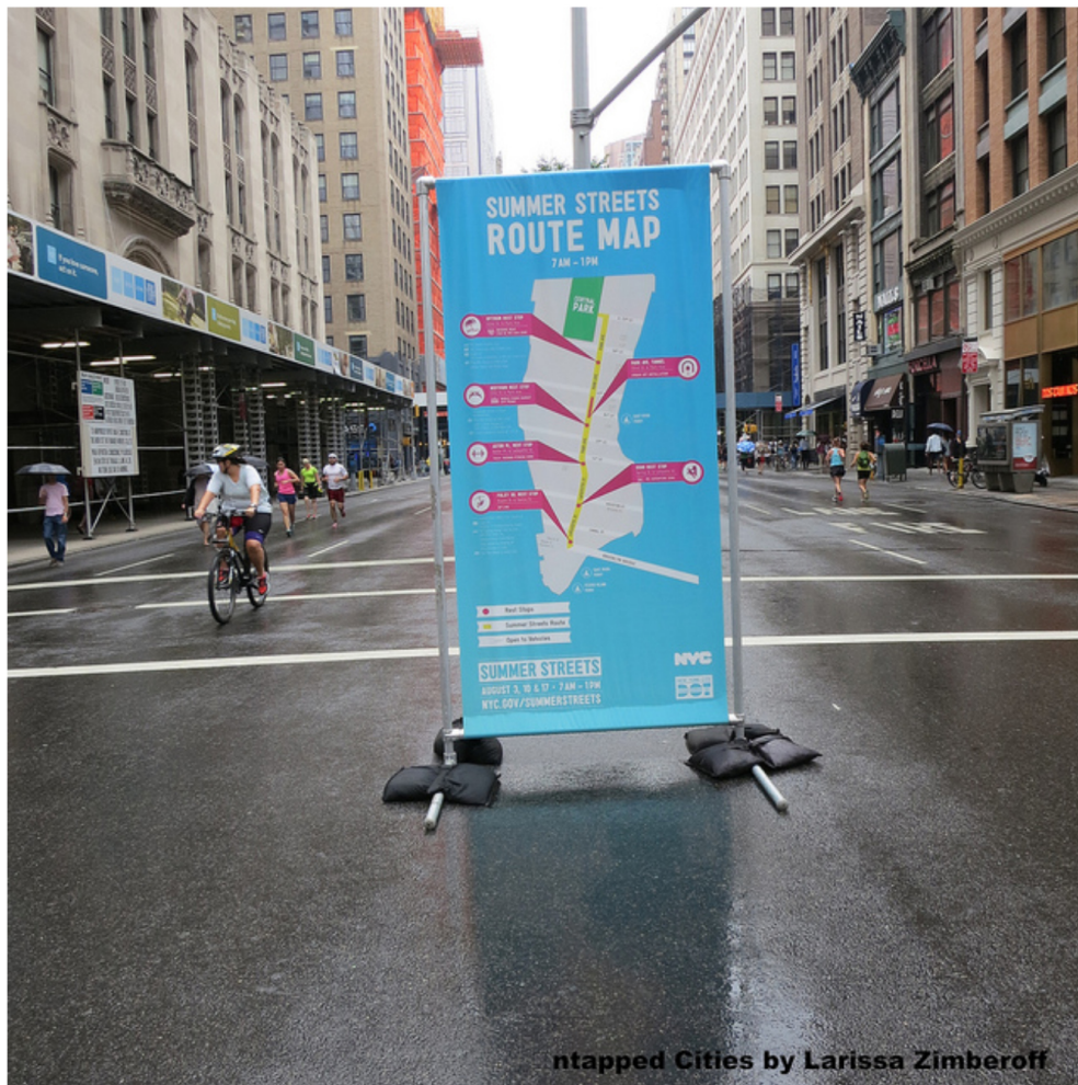
Summer Streets route map showing the seven miles of open streets, plus the six main rest stops.

In 2008, New York City kicked off the first ever Summer Streets , an event designed to get city-dwellers out of their cars and onto the streets. The Department of Transportation closed off routes usually meant for vehicles, stretching from Wall Street all the way up to Central Park, and opened them up to runners, bikers, bladers and walkers. Six years later it's still going strong as an annual event held on three consecutive Saturdays in August. Back with the same route (Lafayette Street to 4th Avenue to Park Avenue), the 2013 Summer Streets