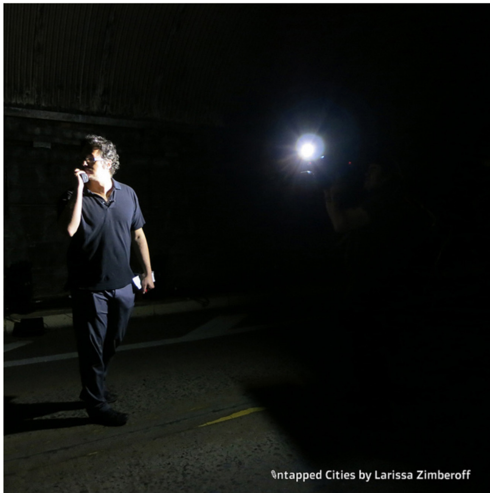
The spotlight is on Rafael Lozano-Hemmer, the artist of the Voice Tunnel, as he is filmed while manning the show.