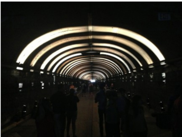
As you get further inside it becomes more immersive.