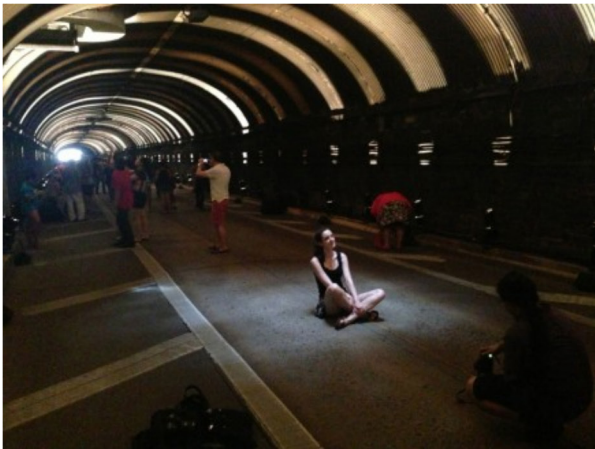
Everyone seemed to want to get pictures of themselves taken in the tunnel.