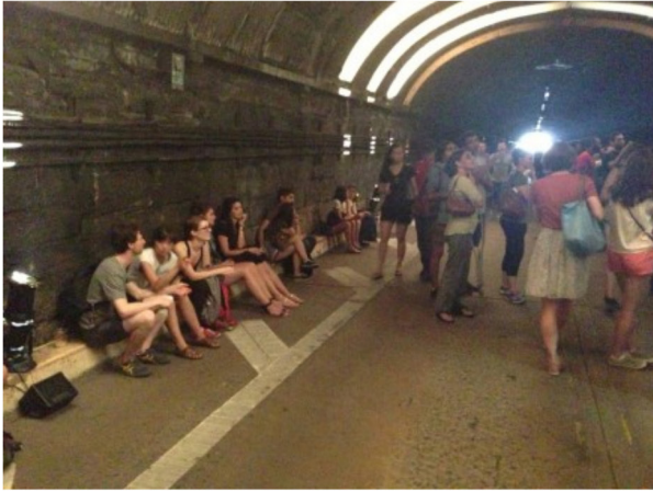
Just after a recording is made, it's played back loudly in the center. People hang out to listen, as well as watch the act of recording.