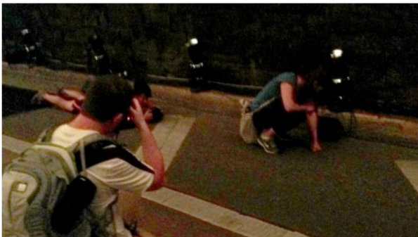
Here I took a picture of a guy taking the picture of a guy taking the picture of a someone listening to a speaker.