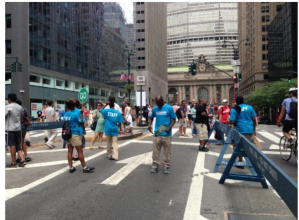
That's it. Just lots of Summer Streets staff controlling the crowds.