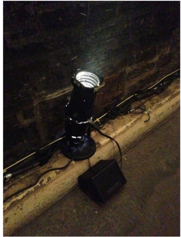
One of the light-speaker elements. If you squat down you can listen to the individual contributions... a mix of the silly and personal.