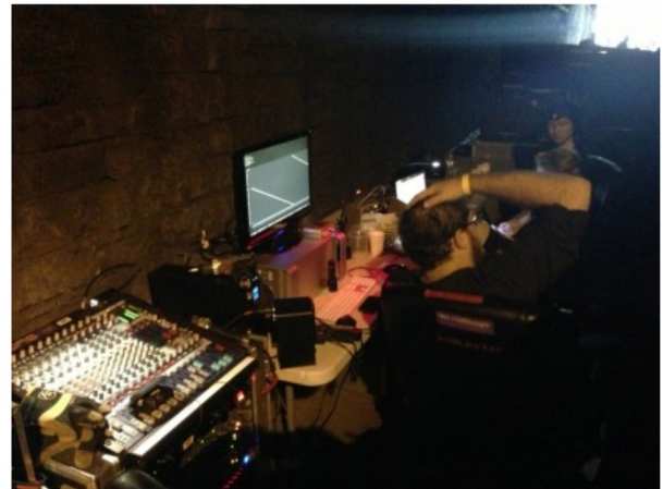
The crew making sure the thing keeps running.