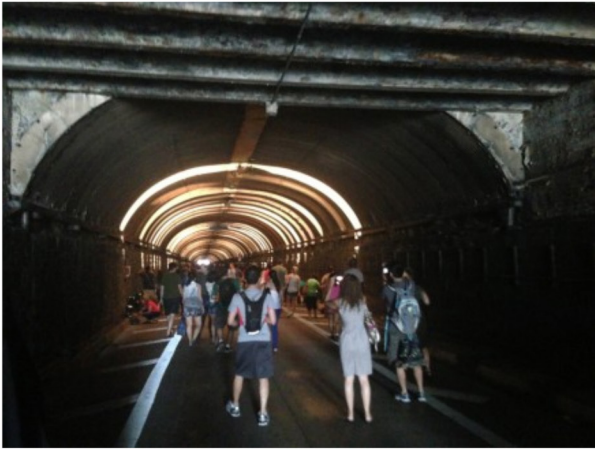
Here it is. The lights start in the center and then come rushing towards you, along with the audio.