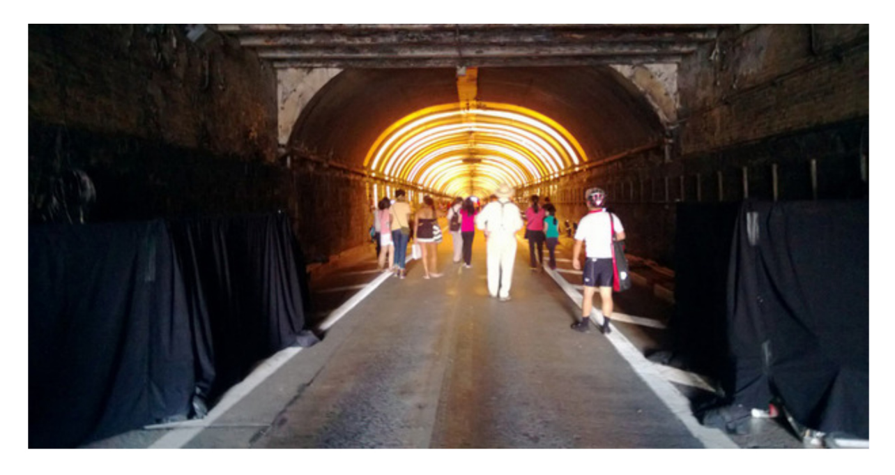
Thank you to <u>Windows Phone</u> for sponsoring In the Gloaming on Cool Hunting. All images for this series, unless otherwise noted, have been shot using the PureView camera on <u>Nokia Lumia 928</u> and are presented without any retouching.