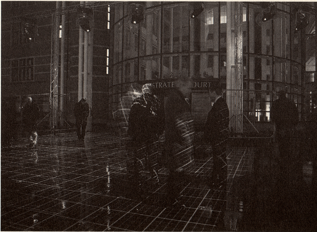
FIGURE 63 Rafael Lozano-Hemmer, Under Scan, Relational Architecture 11, 2006. Castle Wharf, Nottingham, UK.

not the world of dance. One parallel is Rafael Lozano-Hemmer's Under Scan , a work, first realized in 2005, that flooded space with an array of bright lights so that the strong shadows of passersby on the floor became backdrops to video segments greeting, gesturing, or provoking them.