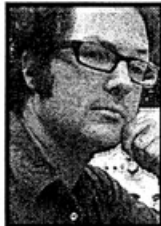
TALENTED: Rafael Lozano-Hemmer is to create an interactive art installation in Lincoln.

He has also been awarded a Golden Nica award at the Prix Ars Electronica in Austria and a clutch of other significant international art prizes.