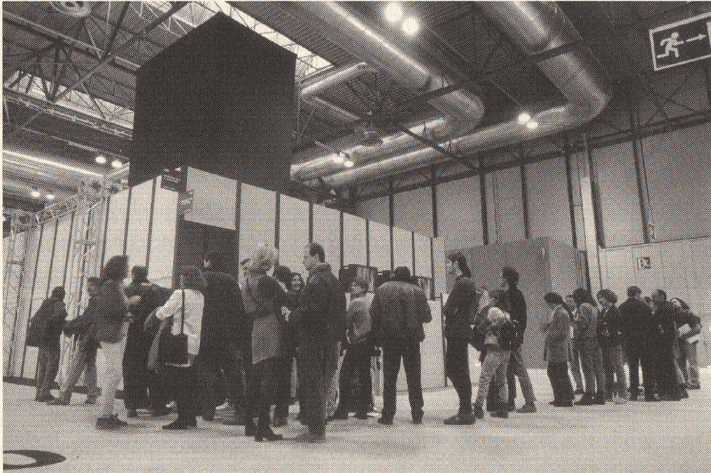
FIGURE 5. Prospective participants line up before entering The Trace in Montreal.

entering the piece in the first place? This is a valid argument but one that points equally back to the account of agency offered by Butler. That is, meaning itself remains structural in Butler, even as particular meanings are revealed to be contingent. Put differently, a certain conflation of reason and cognition remains the condition of possibility for registering Butler's critique, 26 which is really just to insist on a basic point: the moment that the possibility of positively advocating for an ethics (even one of ambivalence) emerges is, and will always be, simultaneously the moment that the menace that is internal to meaning also emerges. That is, the emergence of ethics is the ultimately arbitrary constitution of a restricted perspectival field, where the premises and consequences of an action are calculable to precisely the extent that they are meaningful: if meaning is present, then it is part of a normative operation. The question that pertains to The Trace , then, is whether it succeeds (alongside Butler) in performing ambivalence in its radical character as the end of determination. The answer to this question is not clear, which is to say that Butler's ethics of ambivalence, which is presented here as the ethics of The Trace , is itself ambivalent. The answer to the question is a field of other questions.