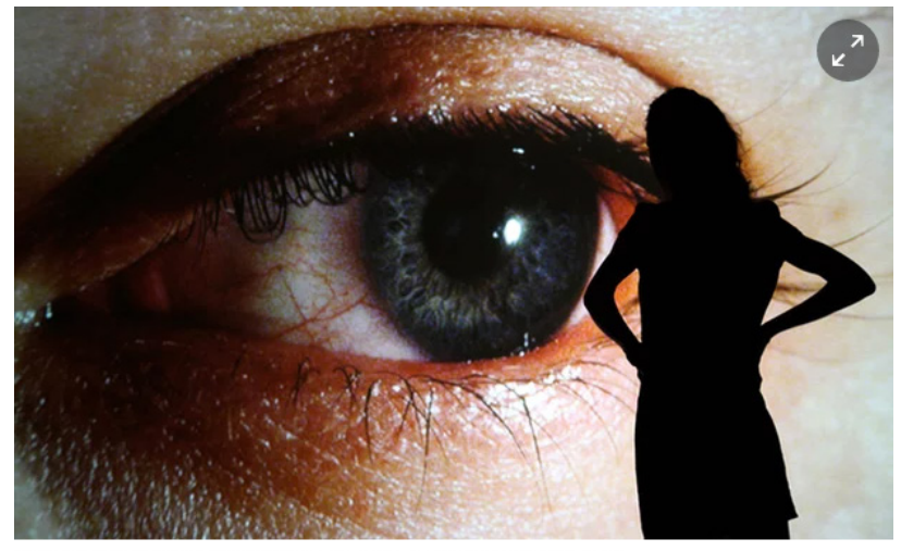
Rafael Lozano-Hemmer, Surface Tension, 2007, at Electronic Superhighway