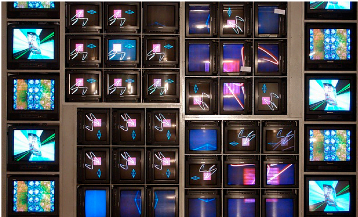
Nam June Paik, Internet Dream (1994), video sculpture, 287 x 380 x 80 cm. ZKM | Collection © (2008) ZKM | Center for Art and Media Karlsruhe, Photo: Steffen Harms

The dot-com boom, from the late 1990s to early millennium, is examined through work from international artists and collectives such as The Yes Men ( http://theyesmen.org ) who combined art and online activism in response to the rapid commercialisation of the web.