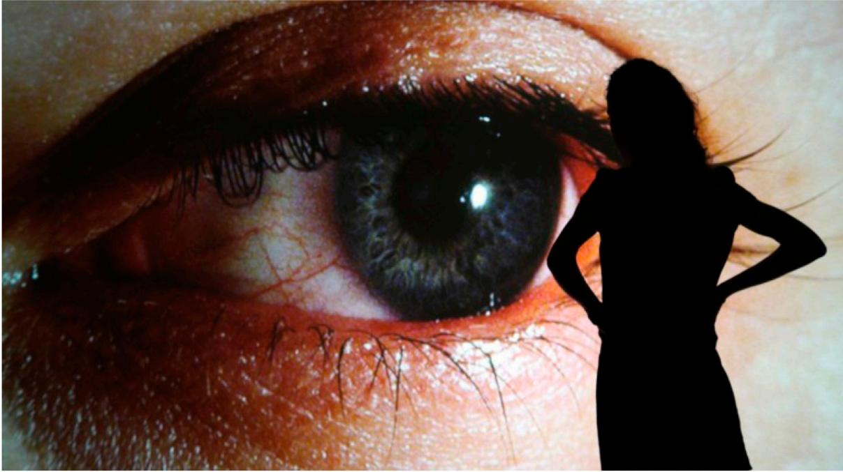
Rafael Lozano-Hemmer, Surface Tension (1992) Courtesy the artist and Carroll/Fletcher, London. Installation photograph by Maxime Dufour © Rafael Lozano-Hemmer