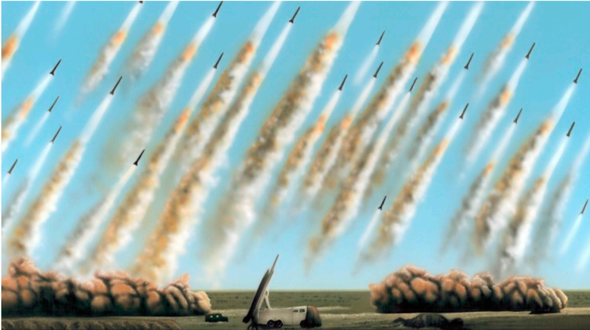
Oliver Laric, Versions (Missile Variations) (2010) Private Collection, London. Image courtesy the artist and Seventeen Gallery, London © Oliver Laric

Electronic Superhighway begins with works made between 2000 – 2016, and ends with Experiments in Art and Technology (E.A.T), an iconic, artistic moment that took place in 1966. Spanning 50 years, from 2016 to 1966, key moments in the history of art and the Internet emerge as the exhibition travels back in time.