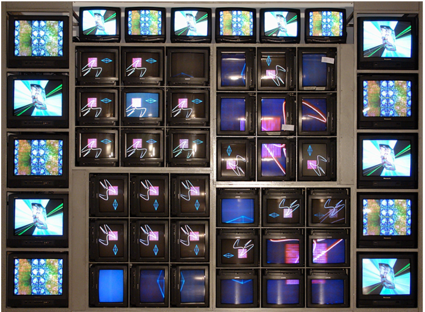
Nam June Paik - Internet Dream (1994)