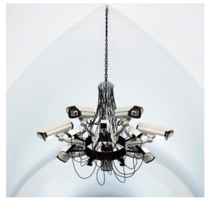
Addie Wagenknecht, Asymmetric Love, 2013, steel, CCTV cameras, and DSL internet cables, 39" x 59". DAVID PAYR/®ADDIE WAGENKNECHT/COURTESY BITFORMS GALLERY NEW YORK

aglen's Autonomy Cube was only one of several works in the show that used interactivity to explore the twilight zone between the real and the virtual. Mouchette (1996), for instance, is an avatar of a teenage artist, created by Martine Neddam. The character Mouchette has her own interactive website (http://www.mouchette.org) that has taken on a spontaneous life of its own in the Internet community, with many users unaware that the site is part of an artwork. In the gallery, one could sit at a terminal and roam Mouchette's gothic universe of blood-spattered images, throbbing music, and mystical symbols—and, disturbingly, offer her advice on ways to commit suicide.