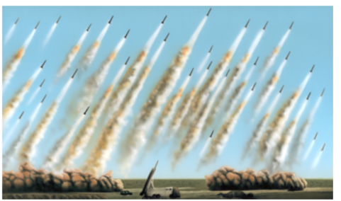
Oliver Laric, Versions (Missile Variations) (detail), 2010, airbrushed paint on aluminum composite board in 10 parts, 9%" x 17%". ©OLIVER LARIC/COURTESY THE ARTIST AND SEVENTEEN GALLERY, LONDON/PRIVATE COLLECTION, LONDON

iven the breakneck pace of technological evolution, the soft- and hardware tools employed by artists are often outmoded almost as soon as the works are created. (E.A.T. performances, such as Frank Stella and Mimi Kanarek playing tennis with racquets fitted with contact microphones that switched lights on and off on impact with the ball, for example, now seem strangely clunky, though the works were radical for their time.)