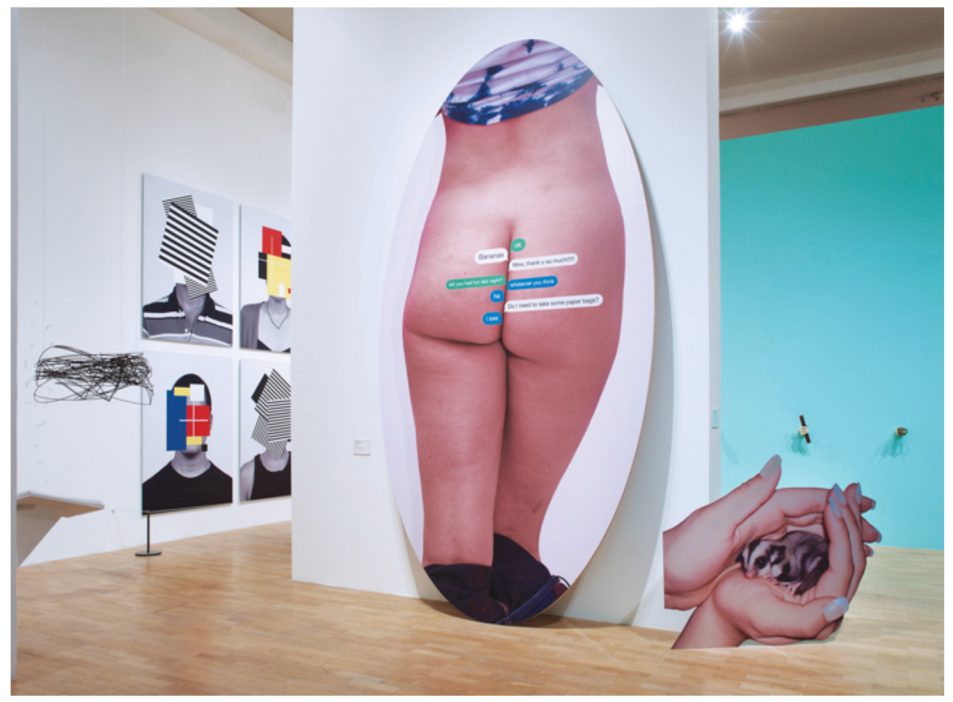
Installation view of "Electronic Superhighway (2016–1966)," 2016.

The curators argued convincingly that E.A.T's marrying of then-novel equipment such as video recorders, projectors, and infrared cameras with live performance, dance, and music made it an important precursor to the mixing of disciplines commonplace in art today. This thesis provided something of a through line for the show, a sprawling, euphoric cacophony of artworks across mediums, not unlike the audio-visual bombardment of information we experience daily from television, advertising, and the Internet.