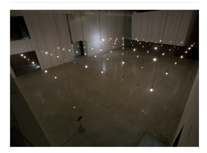
Rafael Lozano-Hemmer, Pulse Room, 2006.