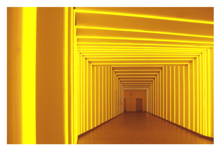
Gunda Foerster, TUNNEL, Permanent work at Berlin Deutscher Bundestag since 2012.

Still other light installation artists can use visibly grounded materials like Holzer's while still maintaining a sense of lightness. For Sphinx Position I , Keith Sonnier used stand-alone neon tubes and aluminum casing to render a simultaneously heavy, industrial, and playful effect.