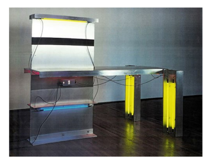
Keith Sonnier, Sphinx Position I, 1988. 84" by 108" by 55". Neon/aluminum.

PROTECT\ PROTECT , Holzer repurposed source material from declassified pages from U.S. government documents to endow the words with new meaning.