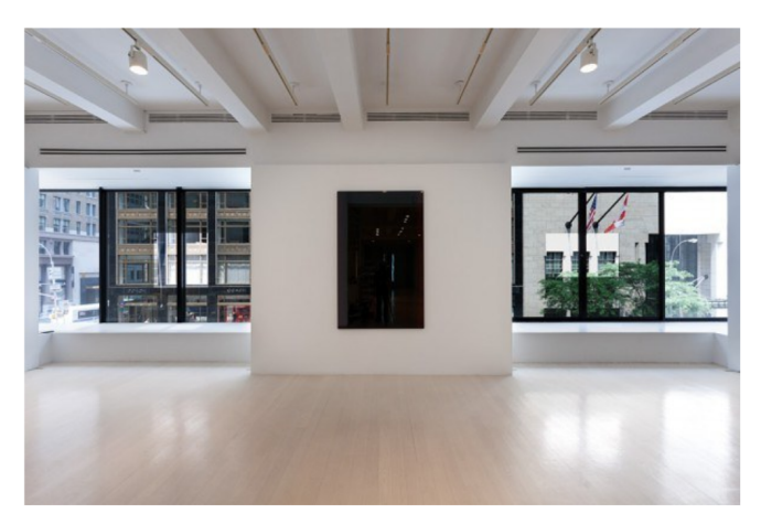
Robert Irwin, Installation view of Doting the i's and crossing the t's: part I, 2012.

People hanging out in New York's Flatiron district in 2010 might remember Jim Campbell's installation Scattered Light . From two A-posts in Madison Square Park, Campbell hung a net of 2,000 LEDs that turned on or off when visitors walked by. The result was a set of ghostly, moving silhouettes taken from a hundred feet away.