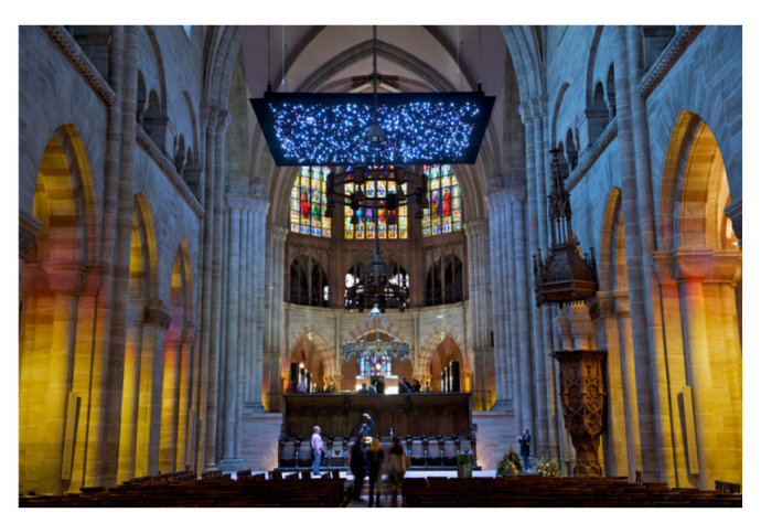
Angela Bulloch, Night Sky: Mercury & Venus, 2010. Installation view.

Taking part in the wave of participatory work in recent art, Rafael Lozano-Hemmer uses robotics, LED screens, and film projections to disturb the uniform conditions in which people interact in groups. For the above Pulse Room , Lozano-Hemmer built an array of incandescent light bulbs that flashed at the exact rate of a participant's heart when he or she held an interface placed on a side of the room.