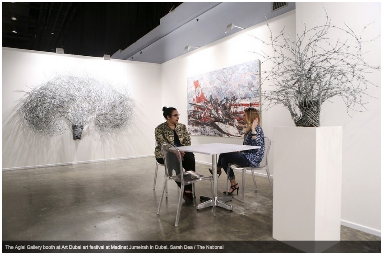
The Agial Gallery booth at Art Dubai art festival at Madinat Jumeirah in Dubai.