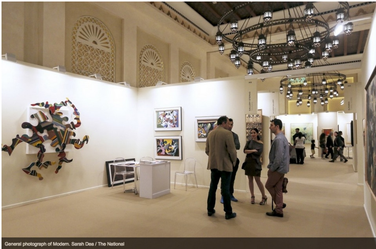
General photograph of Modern.