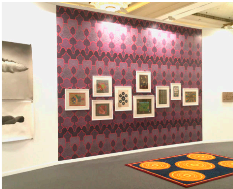
Art Dubai 2015