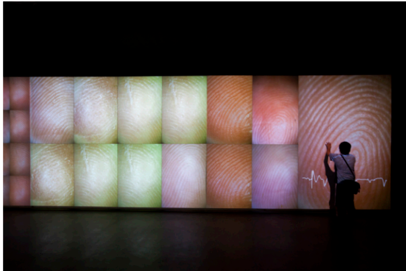
Rafael Lozano-Hemmer Pulse Index (2010)