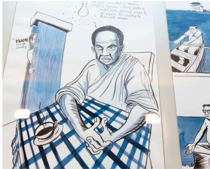
The Abraaj Group Art Prize exhibition.