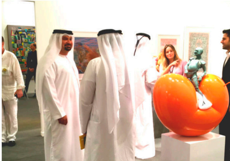
Art Dubai 2015