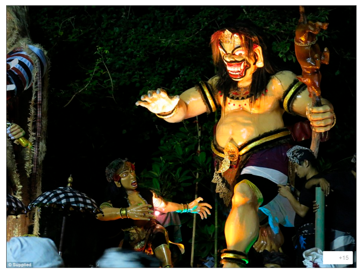
Huge hand-carved Balinese ogoh-ogoh demons (pictured in 2013) will see a return this year before they are set alight on the final night of the event. Traditionally they are paraded through streets as a means of luring evil demons and driving them out of the community