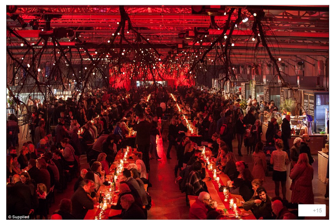
This year, the Winter Feast (pictured in 2014) will occur over five nights while the festival will conclude with a naked swim on June 22 timed to coincide with the winter solstice