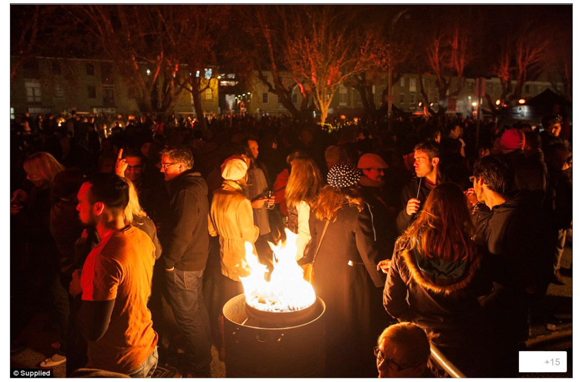
A mixture of art installations and live performances will be available across various locations in Hobart

Attendees are encouraged to write their 'worst fears' on a piece of paper, throw it into the demons' mouths and watch them burn along with the monsters in a 'ritualistic burning to cleanse the community' of its 'collective fears'.