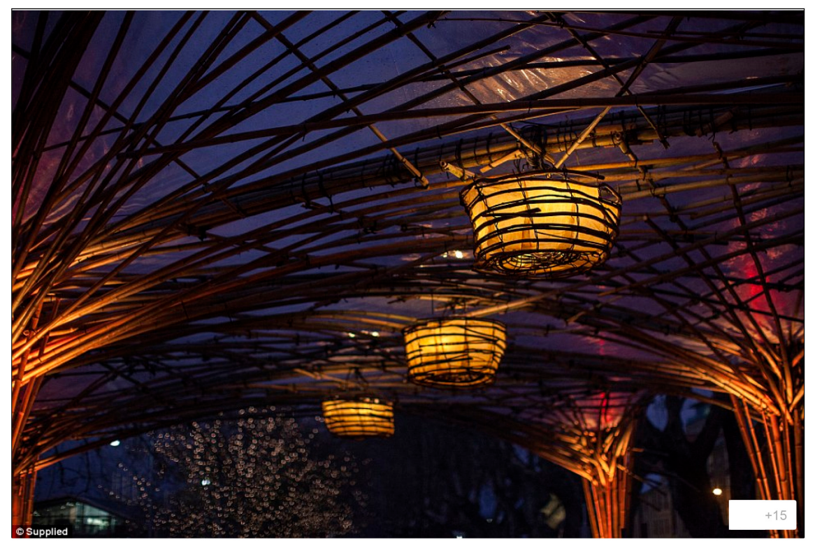
In MONA's trademark style, some event details remained under wraps until just hours before the festival opening

RLH] June 2015: Web. 15 June 2015. (english) http://www.dailymail.co.uk/news/article-3121612/Giant-Balinese-ogoh-ogoh-demons-light-beams-mimic-attendee-s-heartbeats-giant-organ-fueled-five-tonnes-flaming-gas-Welcome-festival-celebrating-darker-life-taken-Tasmanian-town.html