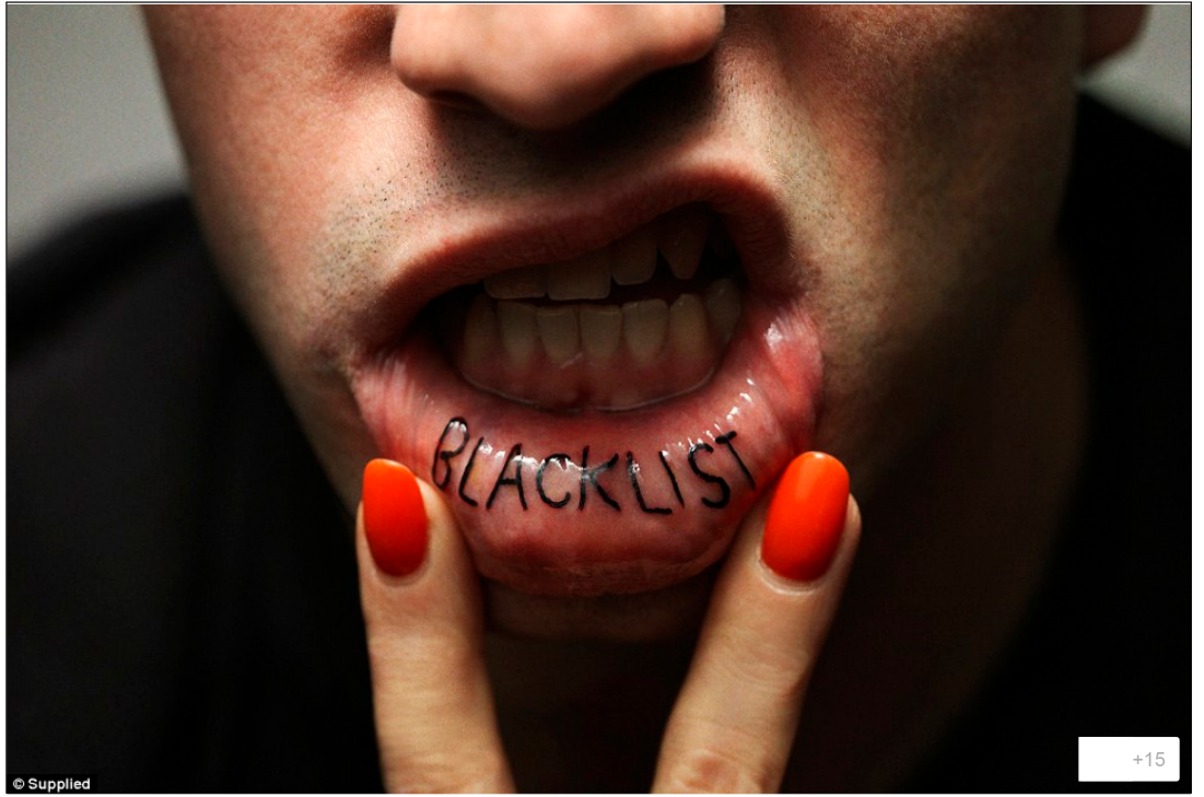
Blacklist, a sold-out, adults-only, late-night dance will be held at 'the infamous venue, Budgie Smugglers', a central Hobart cafe

More than 250 Australian and international artists have contributed to Dark Mofo 2015, which concludes with a naked swim on June 22 timed to coincide with the winter solstice.