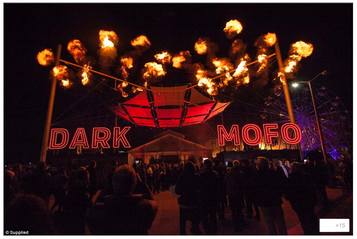
The event asked attendees to brace themselves, bring earplugs and 'get weirder' as it promises to bring Hobart to life over 10 days