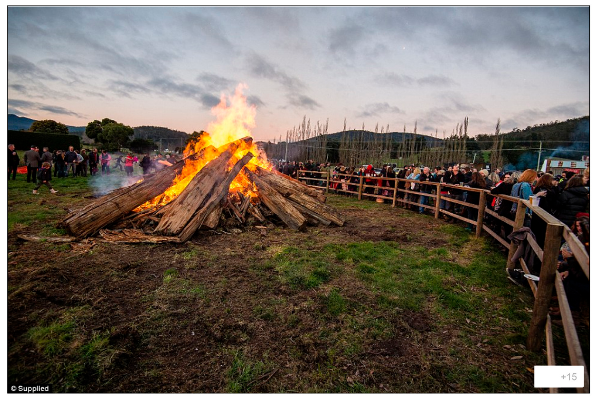
The red-lit Bass Bath which has been described as 'a towering semicircle of subwoofers inside a cavernous old freezer', requires attendees to sign waiver forms and heavy duty ear protection