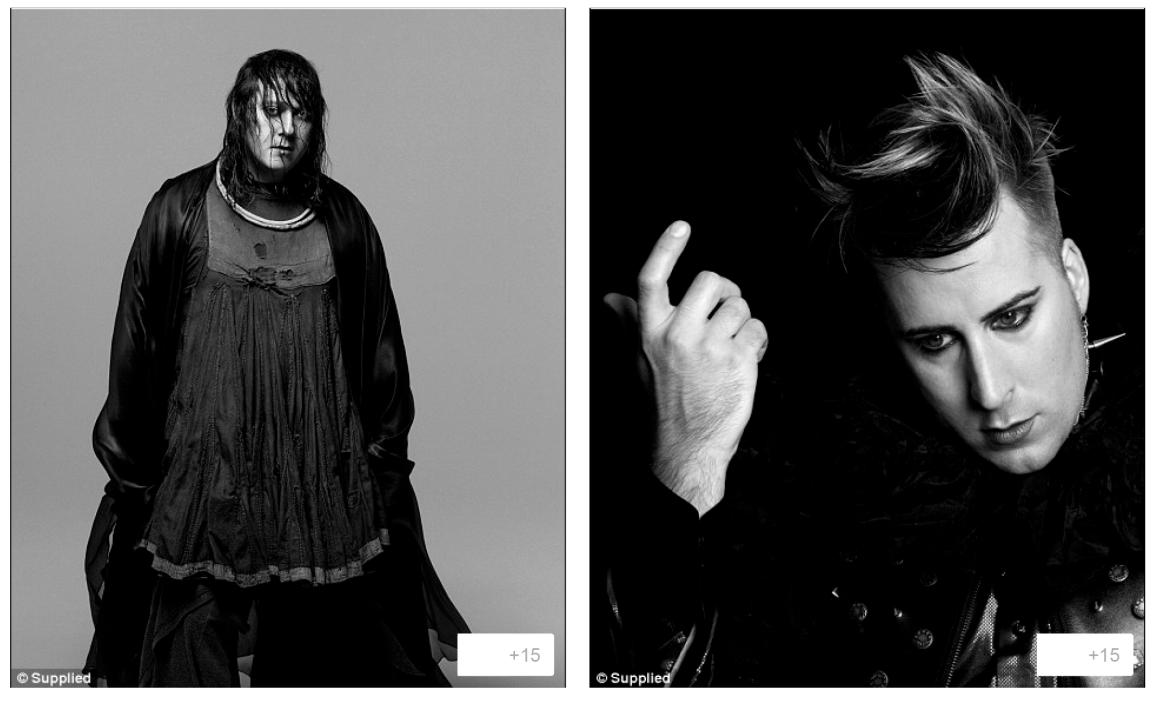
Antony and the Johnsons (left) and The Irrepressibles (right) will be among the performers

The only festival with a 'safe word' – bananas – Dark Mofo has made its name as the dangerous festival, with some art, like the red-lit Bass Bath which has been described as 'a towering semicircle of subwoofers inside a cavernous old freezer', requiring signed waiver forms and heavy duty ear protection.