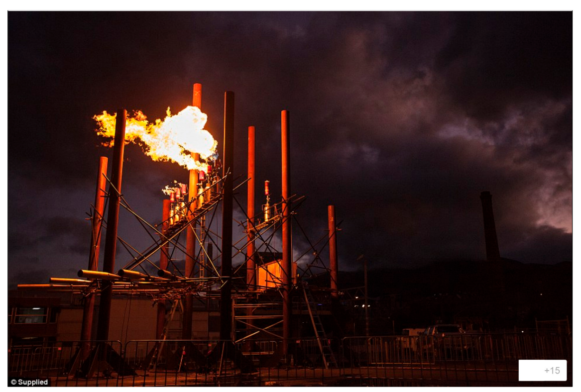
A whopping five-tonnes of gas will be used up by the impressive construction as it continues to play various rhythms for its audience over the next week and a half

RLH] June 2015: Web. 15 June 2015. (english) http://www.dailymail.co.uk/news/article-3121612/Giant-Balinese-ogoh-ogoh-demons-light-beams-mimic-attendee-s-heartbeats-giant-organ-fueled-five-tonnes-flaming-gas-Welcome-festival-celebrating-darker-life-taken-Tasmanian-town.html