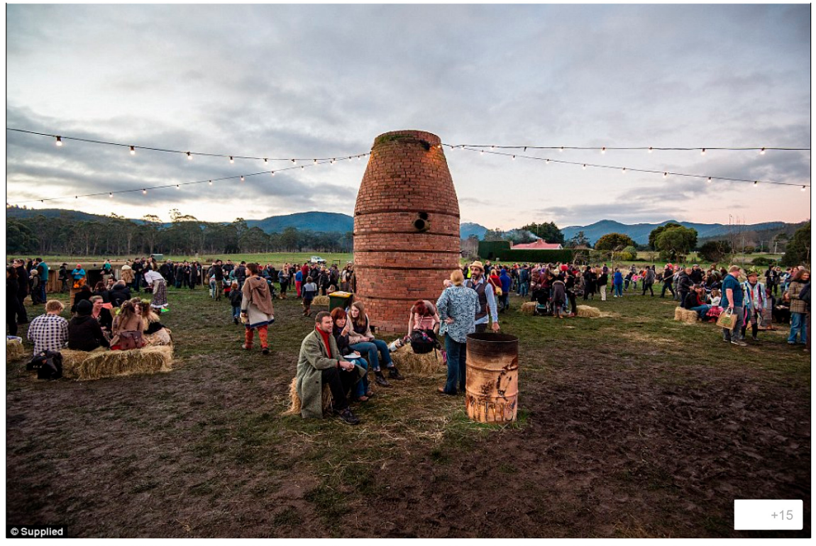
Pictured: Huon Valley Mid Winter Fest in 2014: This year's he main showground is located at Macquarie Point - an abandoned industrial space used to store shipping containers which has been scattered with brightly lit food vans, bars and art for the event