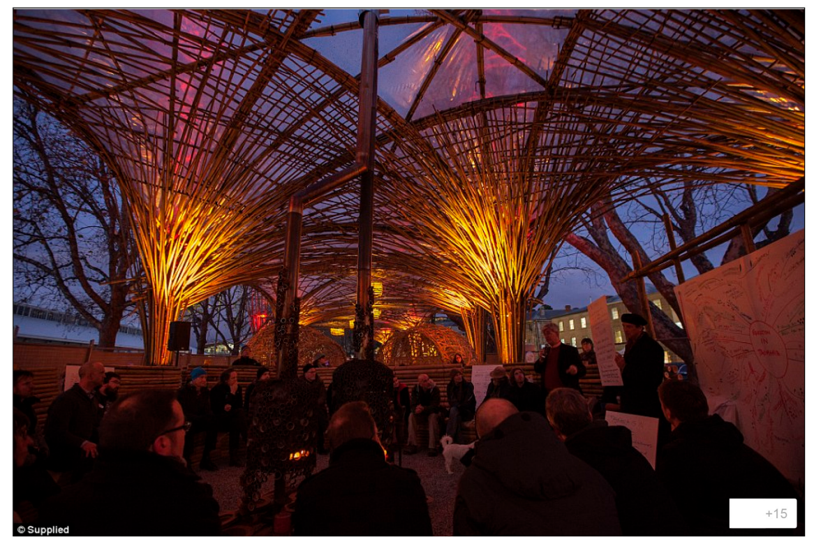
Organisers are expecting about 150,000 people to attend the 10-day schedule of events, which includes sights, sounds, a feast and a night in the forest