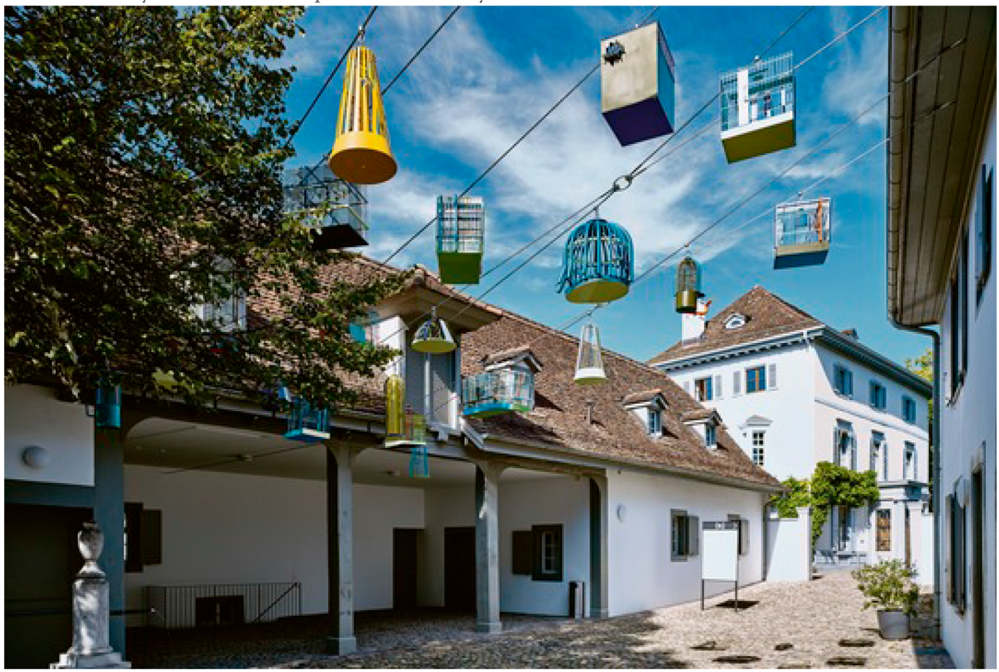
The attention on flora and fauna, using beehives and birdcages, is an integral part of 24 Stops. Tobias Rehberger, 24 Stops, 2015/16.

Fondation Beyeler, Calder & Fischli/Weiss, until 4 September Alexander Calder and Fischli/Weiss, now on show at the Fondation Beyeler, seem an unlikely pairing for an exhibition. What does the Modernist mobile-maker have in common with the contemporary conceptual collaborators? Balance, movement and the potential for things to fall apart, says the show's curator, Theodora Vischer. The curator likens the Swiss duo's Questions (2002-03)—a projection in a dark room of "simple, so-called small questions that are suddenly quite deep and touching"— to losing yourself in a room of Calder's mobiles, which you "perceive not only as single works, but as a whole entity of different correspondences," she says.