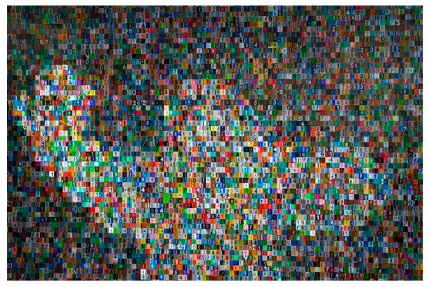
Rafael Lozano-Hemmer, 1984x1984. Screenshot (2015).

Rafael Lozano-Hemmer: Preabsence, Haus der Elektronischen Künste, until 28 August The electronic artist Rafael Lozano-Hemmer is on (artistic) home turf with his show at Haus der Elektronischen Künste. With no fewer than 11 of his interactive works on show, from sound sculptures to data-driven displays, the exhibition reflects on human presence and absence in times of constant surveillance. The show includes the artist's best-known work, Pulse Room (2006), an installation of hundreds of light bulbs that flash to the heartbeat of participants holding pulse sensors. Also on show is Lozano-Hemmer's new work Redundant Assembly, which scans the faces of visitors and creates a changing patchwork portrait.