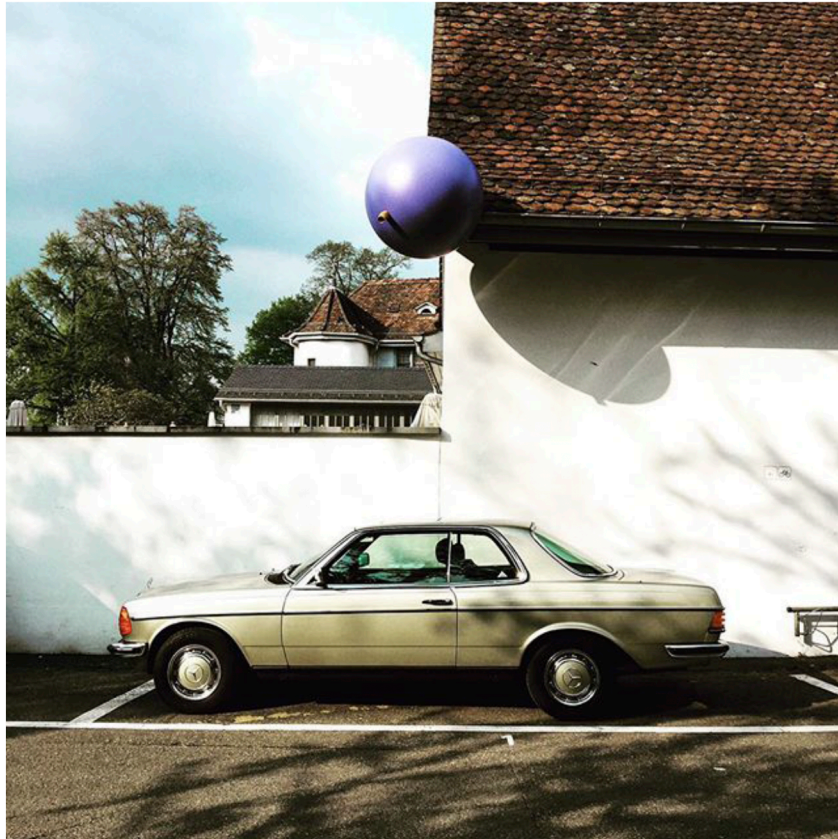
A car parked underneath a Tobias Rehberger-designed water spout, found along the path of "24 Stops."