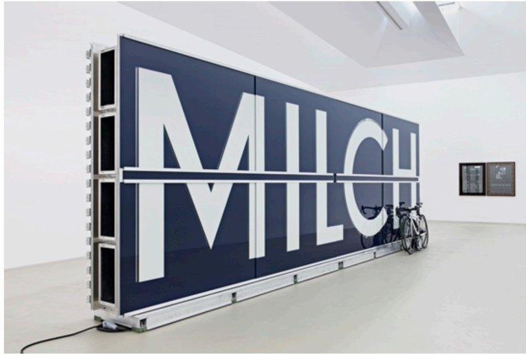
Reinhard Mucha, Ohne Titel (MILCH) , [2014] 1979 (Detail).