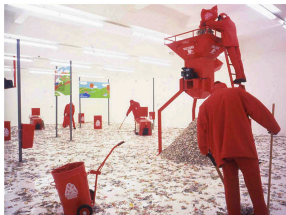
Michael Landy, Scrapheap Services , (1995). Installation view Chisenhale Gallery, London, 1996. Tate Collection, London. © Michael Landy.

The present exhibition focuses on an expansive installation titled Frankfurter Block , [2016] 2014, 2012, which exemplifies the artist's complexity and laboriousness. — Carol Civre