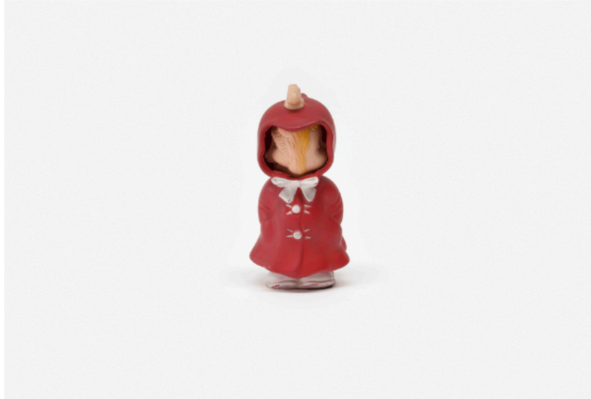
Roni Horn, "The Selected Gifts" (1974–2015) (detail).