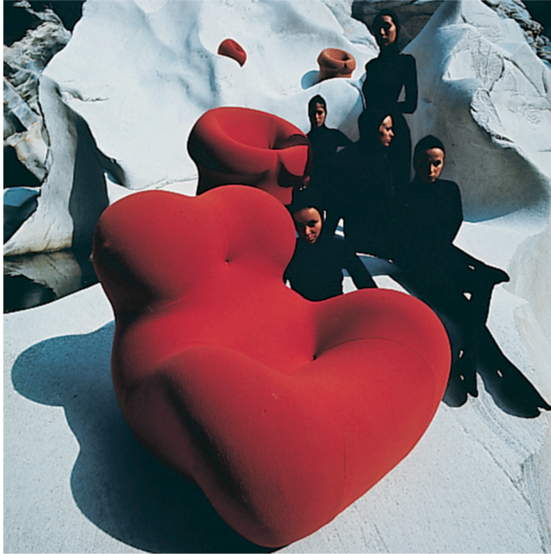
Gaetano Pesce, La Mamma chair. From the exhibition "Radical Design". Courtesy of Vitra Design Museum.