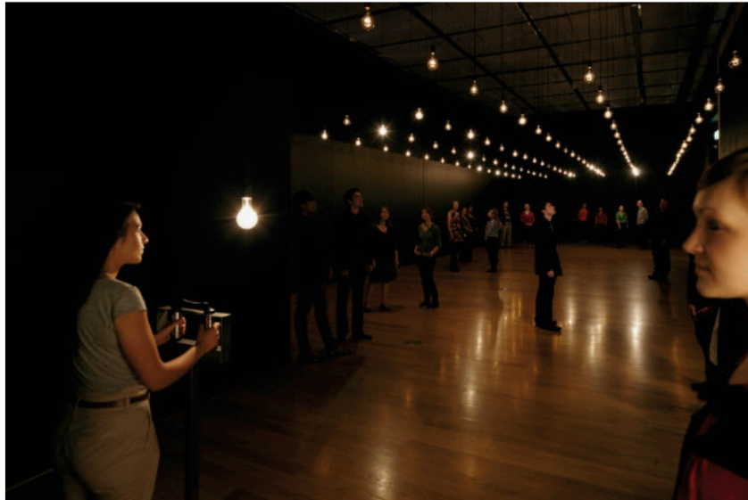
Rafael Lozano-Hemmer, Pulse Room, 2006.