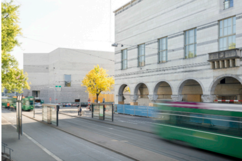
The newly-renovated Kunstmuseum Basel (right) with the adjacent new building (left).

Once again, Art Basel is upon us. Everyone is getting ready to walk miles and miles of art fair aisles perusing the best art on the market from all the world.