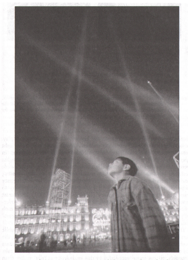
Figure 6.1 Rafael Lozano-Hemmer, Vectorial Elevation, Relational Architecture 4', 1999–2004 (Interactive installation at the Zócalo Square in Mexico City and at www.alzado.net.)

Finally, Vectorial Elevation drew on the history of large-scale light display. Lozano-Hemmer (2002) explicitly evoked Albert Speer's notorious 'light dome' created for a Nazi Party rally in Nuremberg in 1935, arguing: 'In Speer's spectacle of power, people were props, just like the searchlights were.' In contrast to such centrally controlled spectacles, which were designed with the aim of exerting maximum impact on the 'masses', Lozano-Hemmer aimed to use media networks to redistribute social agency in public space. As he later put it: 'I tried to introduce interactivity to cransform intimidation into intimacy' (Lozano-Hemmer 2003). In contrast to what he called 'cultish extravaganzas whose effects were created to overwhelm the senses, to evoke false unity, or to provide a backdrop for mob rallies', Lozano-Hemmer's ambition was to create a 'dynamic agora' (Lozano-Hemmer 2003).