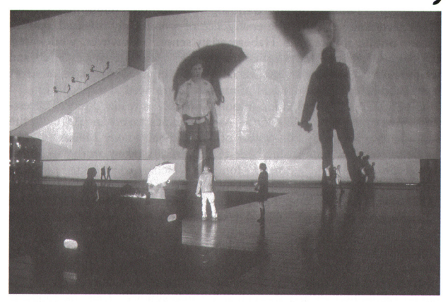
Figure 6.3 Rafael Lozano-Hemmer, 'Body Movies, Relational Architecture 6', 2001–06 (Large-scale interactive installation featuring over 1200 giant portraits that are revealed inside the shadows of passers-by. First installed by V2 at the Schowburg Square in Rotterdam. Photo by Ian Streii)

developing a dynamic and participatory social space. As Timothy Druckrey (2003) argues: