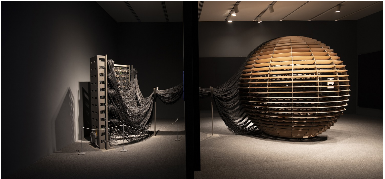
Sphere Packing Bach by Rafael Lozano-Hemmer.

When you step into Rafael Lozano-Hemmer's exhibition Unstable Presence at San Francisco's Museum of Modern Art, a huge projected screen looms above you. Massive, strange questions flash across the screen slightly too fast to grasp.