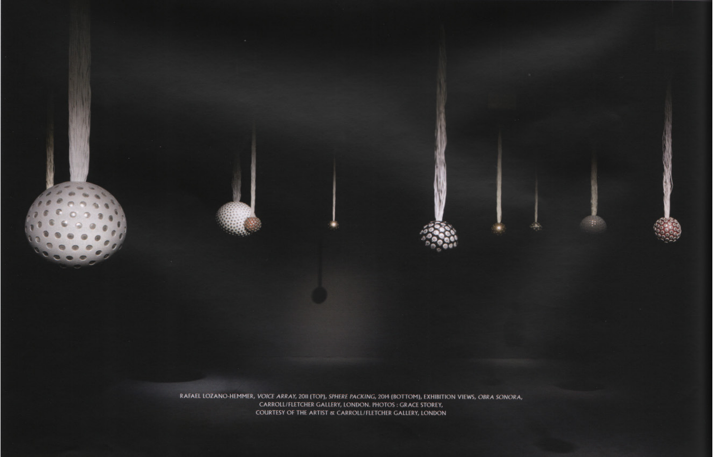
RAFAEL LOZANO-HEMMER, VOICE ARRAY, 2011 (TOP), SPHERE PACKING, 2014 (BOTTOM), EXHIBITION VIEWS, OBRA SONORA, CARROLL/FLETCHER GALLERY, LONDON.