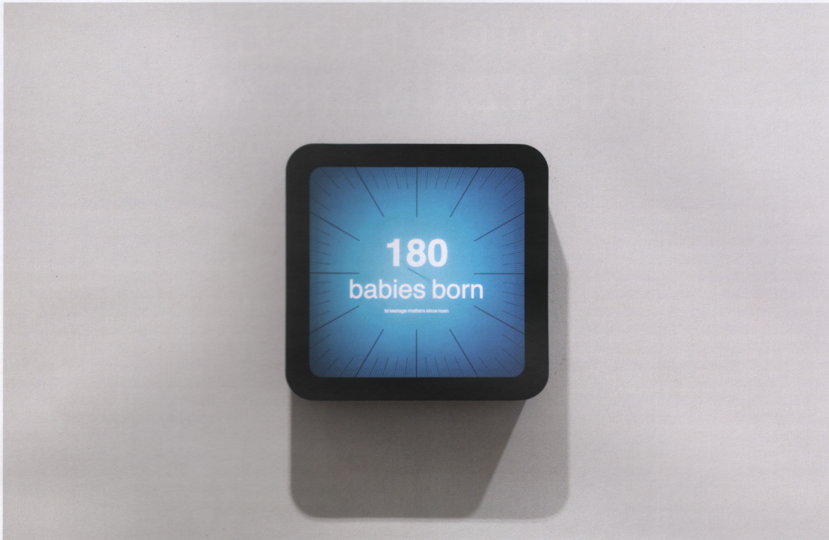
RAFAEL LOZANO-HEMMER, ZERO NOON , 2013.

to die can be. Lozano-Hemmer's decision to produce a data-set with a finite lifespan draws attention to how data's ostensibly infinite life can put pressure on the biological, finite lifespans of the individuals to which they refer.