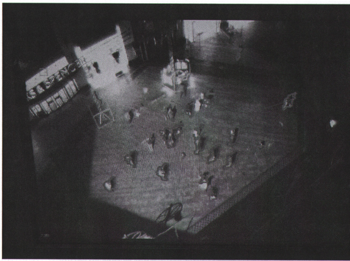
Plate 7.2. Rafael Lozano-Hemmer, Under Scan , 2006. Public art installation, Leicester, United Kingdom.

Watching the screen is equivalent to being watched, and an agreement to be invigilated. Orwell's observation, made over sixty years ago, is one of the axioms of surveillance in the age of digital post-optic technology, and especially in the age of the Internet. However, it can also be seen as a characteristic of digitalised optical surveillance.