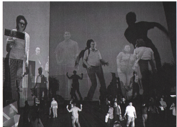
Plate 7.1. Rafael Lozano-Hemmer, Body Movies , 2006. Interactive projection, Hong Kong, China. Photo by Antimodular Research. Courtesy of the artist.

This limiting potential also has a time dimension: the presence and length of the projection depends on the attention that a random passer-by will devote to a virtual other met inside one’s shadow, which is an example of dictating voyeurism. However, while observation can be understood as a kind of existential imperative, in Lozano-Hemmer’s works observation is interpreted also as a process directed by the viewer rather than the object of the viewer’s gaze. Thus, voyeurism becomes a form of narcissism. For Lozano-Hemmer, contemporary forms of surveillance are based on fluid hierarchies and interchangeability of the viewers and the viewed. The character of a celebrity replaces the figure of an invisible guard. The fear of invigilation changes into a desire of being watched.