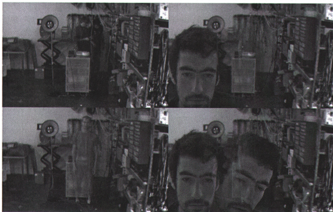
Plate 7.4. Rafael Lozano-Hemmer, Alpha Blend , 2008. Interactive display with a built-in computerised tracking system.

However, the decision to use technology, to interact, means accepting invigilation. It can be even said that approval of invigilation is a conditio sine qua non (an indispensable and essential condition) of using interactive technologies. 15 The process of surveillance is not connected to analysis of specific features of the viewer-interactor, but it is initialised and happens automatically. Similarly adding to the database, defining a place within this structure has nothing to do with individualisation. It is also free of any categorisations. A video file, being a record of a successive viewer-interactor's activity, is just another entry in the database. Its subjects are deprived of individual identity and homogenised; they become one of many recordings, forming an undifferentiated mass of data.