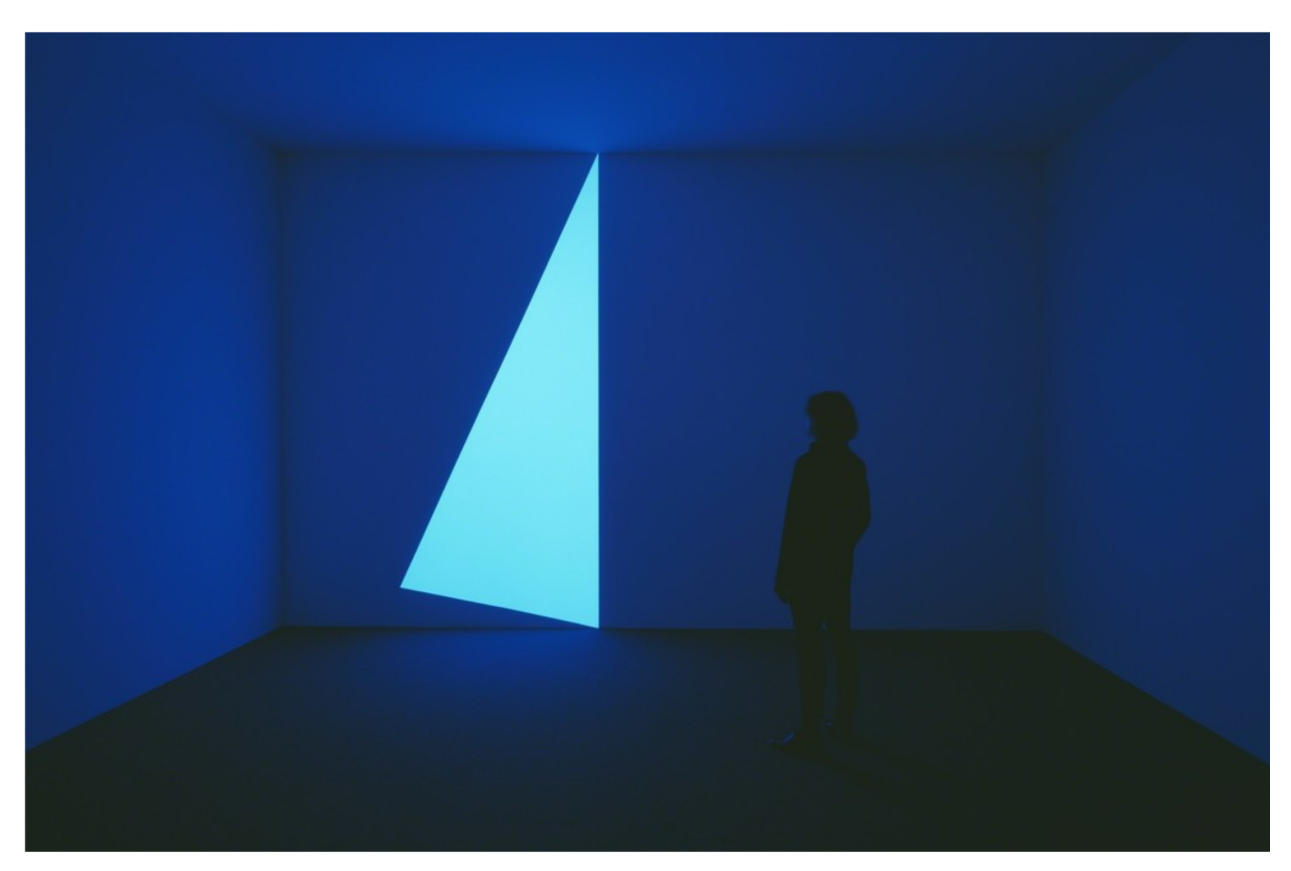
Installation view of "James Turrell: 67 68 69" at Pace Gallery.

ARTSY EDITORIAL BY RACHEL LEBOWITZ MAR 31ST, 2017 10:28 PM