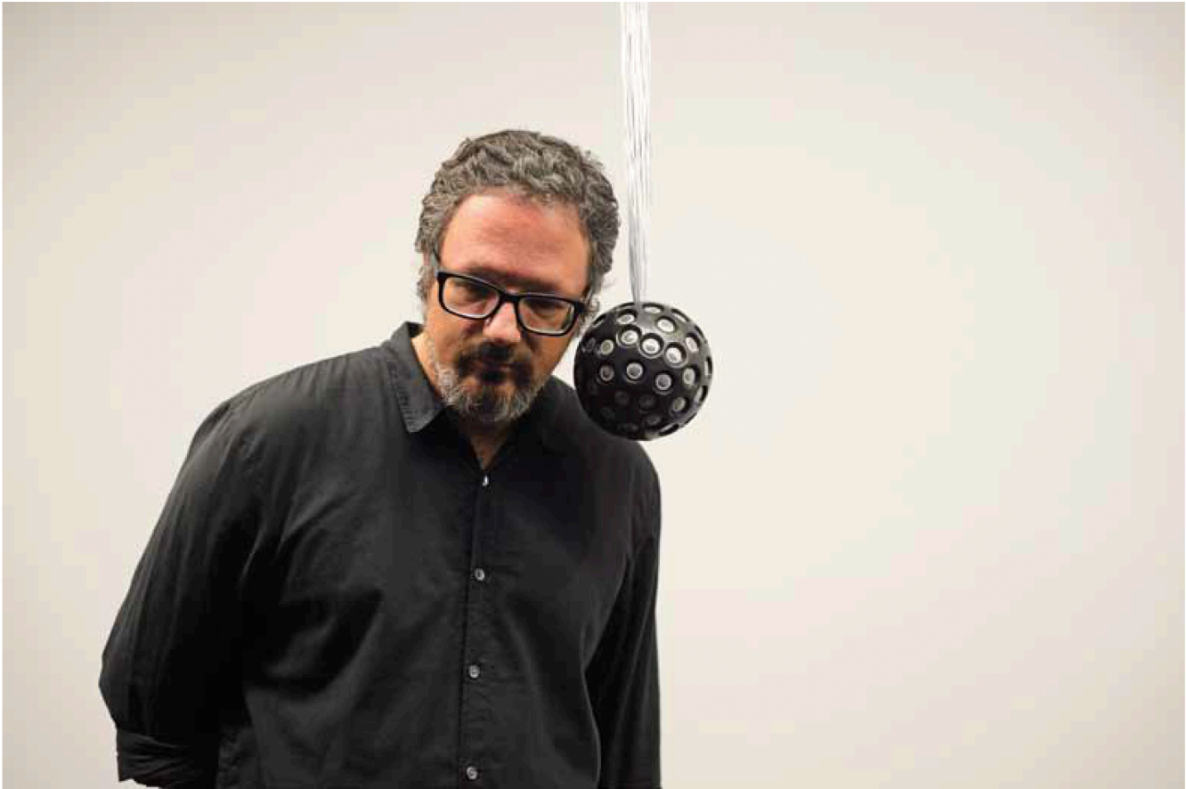
Rafael Lozano Hemmer next to Sphere Packing: Luigi Nono, 2014, ceramic 3D print, 70 audio channels, stainless steel, electronic cards, Arduino, 4 23/32" diameter.