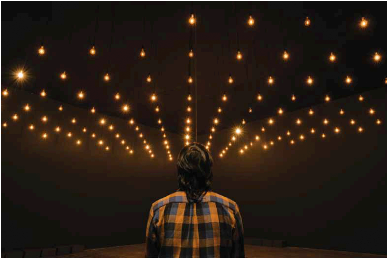
Rafael Lozano-Hemmer, Pulse Room , 2006, incandescent light bulbs, voltage controllers, heart rate sensors, computer, stainless steel stand, variable dimensions.

sphere is a vast repository of everything that has ever been said and that we could potentially “rewind” the movement of air molecules to re-create the voices of everyone who has spoken in the past. I love that in Babbage’s vision we coexist with the voices from the past. In Vicious Circular Breathing , the other installation in the room, you are invited to enter a hermetically sealed chamber to breathe the stale air that has already been breathed by everyone before you. I don’t want so much to produce a collective experience as I want people to think about limits to the commons, the resources we share like water, air, solar energy and so on. Also, in this piece I like that the air that is in your body, in your lungs, becomes the public air after exhalation and vice versa. There is a constant transformation of the private into the public that makes evident the continuity between them.