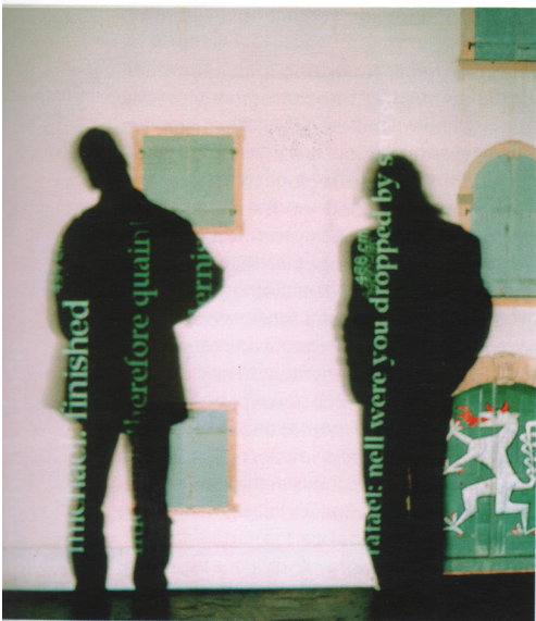
RIGHT: Piel Capaz, a technological coffin for vampire buildings. A virtual reality installation that visualises resting sites for emblematic buildings that are not allowed to have a natural death. The participant's motion controls the point of view in the projected environments on the wall and on the floor. Credits: Emilio Lopez-Galiacho (concept, visuals), Rafael Lozano-Hemmer and Will Bauer (interaction).