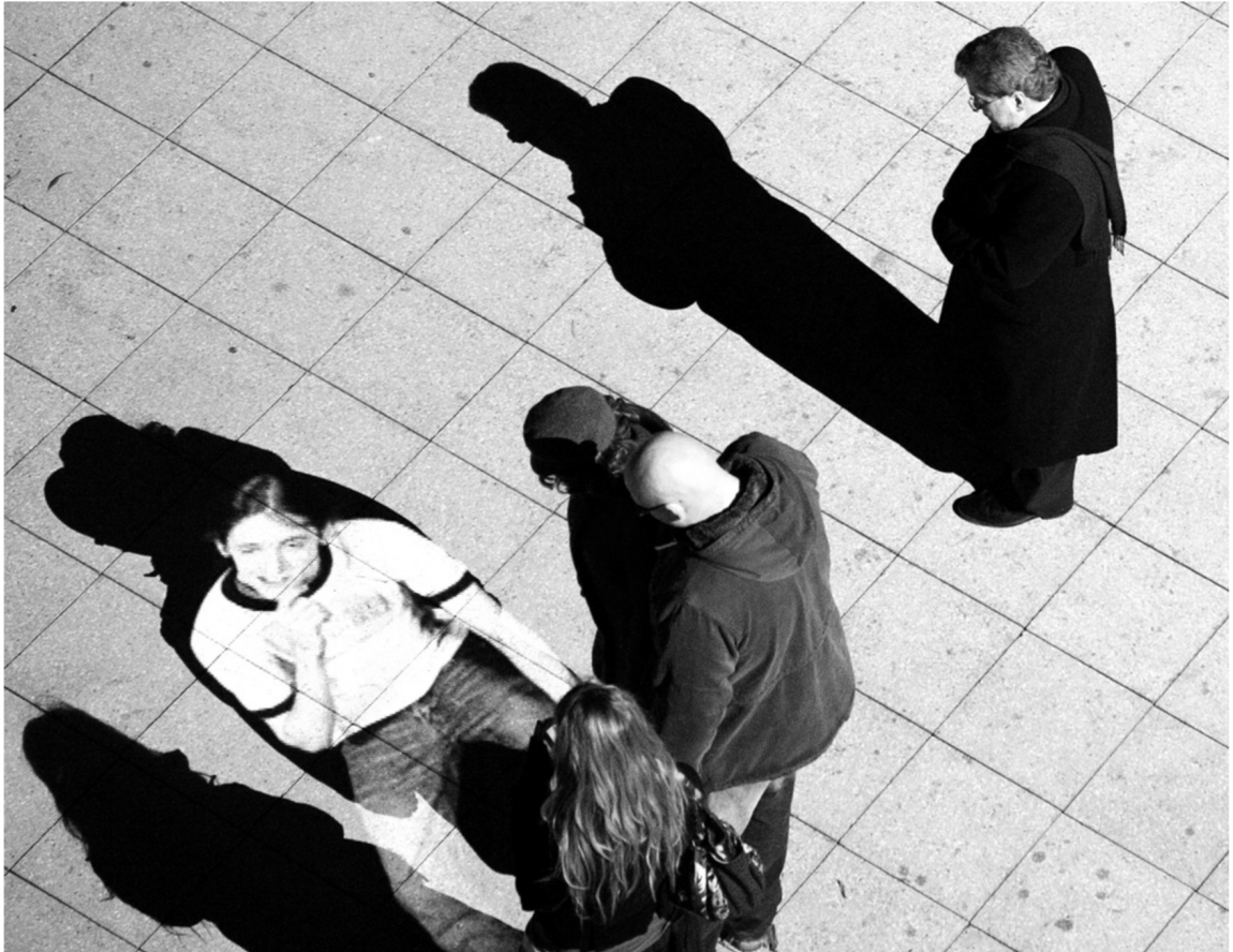
Under Scan , multiple UK locations.

FROM ISSUE 31.1: Thursday 20th Dec 2012 ARCADE 31.1 Winter 2012