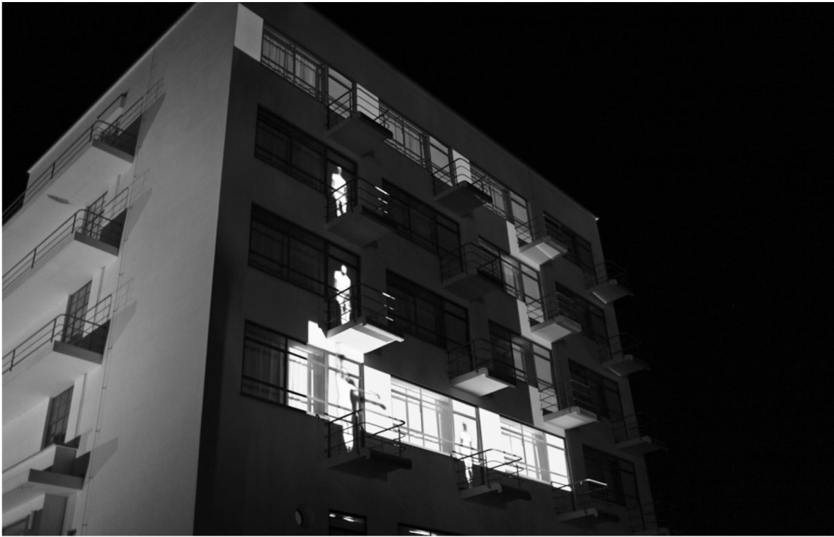
Kreisrot, Dessau, Germany.

Most cities are not yet prepared to address this art form. Not too long ago, images of individuals who had died in custody were projected on CIA Headquarters. The police immediately confronted the artists, but in the end, determined that the only legal way to stop the projection was if it drew too large a crowd and became a nuisance. As the number of projected-light installations increases, location and content will become important discussion points.