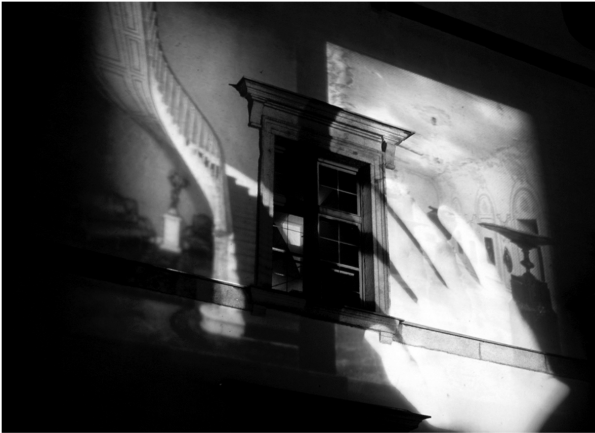
Displaced Emperors , Linz, Austria. Courtesy of Rafael Lozano-Hemmer.

Fortunately, there are individuals who are exploring the potential of new light-media to animate nighttime cities. They are a particular breed of artist who use light as a tool for making extraordinary nighttime places, moving beyond simply illuminating public space to animating it.