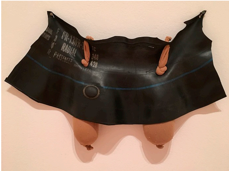
A piece by Senga Nengudi THE STRANGER

Read more of the 196 moments in music, art, books, theater, film, and TV that helped us survive 2016.