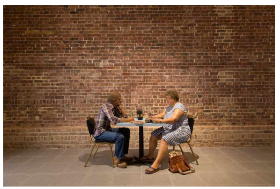
Duane Hanson; Installation View

Scottish National Gallery of Modern Art, 75 Belford Road, Edinburgh, Scotland. +44 131 624 6200