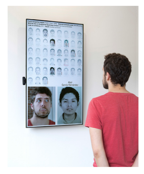
Rafael Lozano-Hemmer, "Level of Confidence" (2015)

This open-source approach — not just of making "Level of Confidence" available, but also of making it mutable and customizable — expands the consciousness-raising power of the piece exponentially. Imagine, for instance, using it to render images and matches for all of the Black Americans killed by police just this year alone. And, of course, making the software available to any institution with an interest in showing it means that the piece can be exhibited in places where Lozano-Hemmer himself might never have imagined — the names, faces, and stories of the disappeared students appearing in places where the news about them did not or where it failed to resonate.