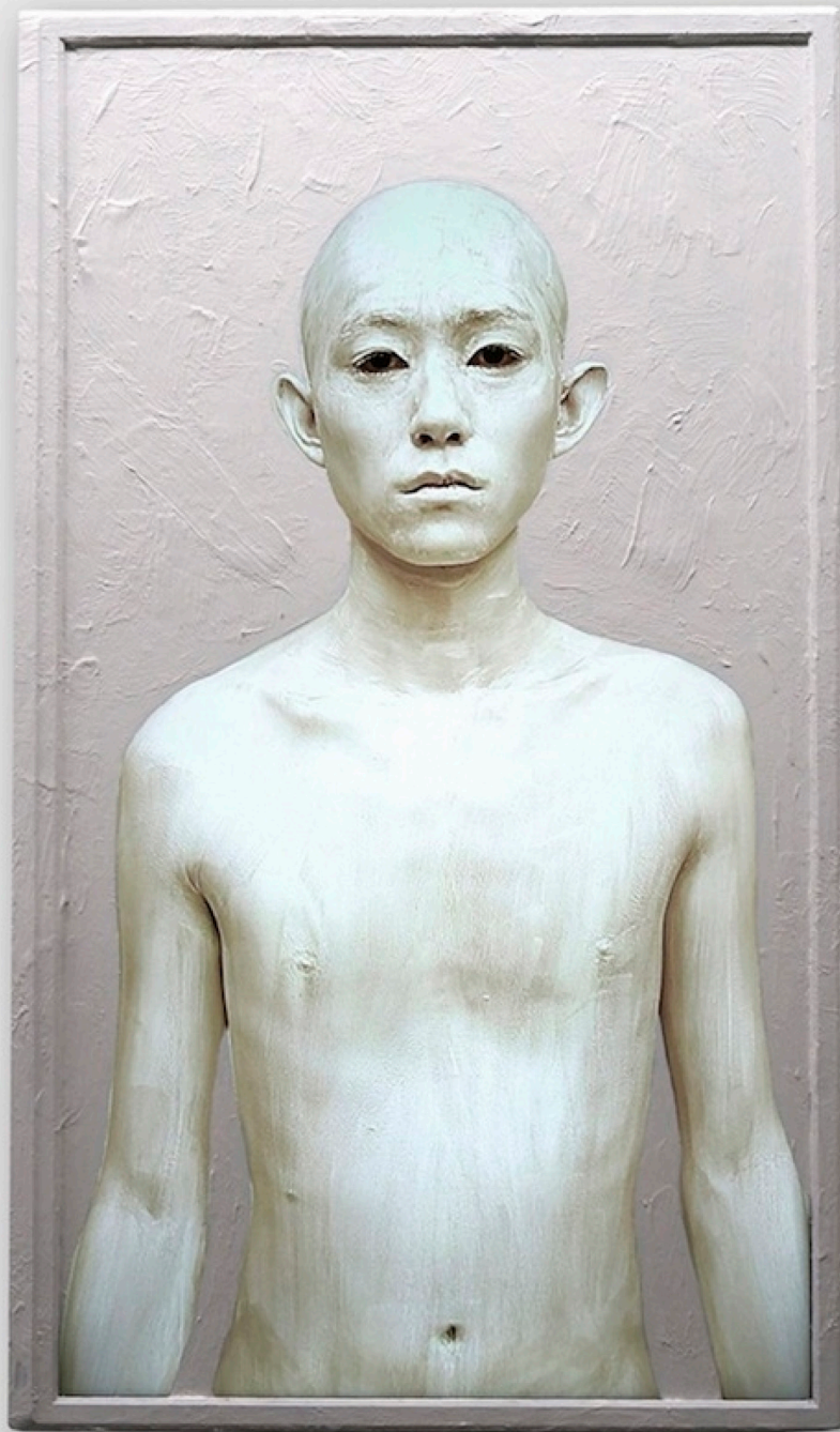
exonemo, Body Paint - 50inch/Male/White , 2015 50 inch 720p plasma screen, acrylic paint, video screen: 48 x 29 x 2 in / 121.9 x 73.7 x 5.1 cm video: 2 minutes