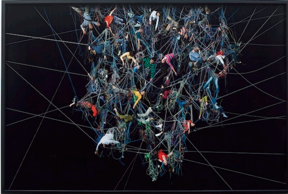
Canogar, Enredos 1 (small) , 2007 Kodak Endura photo mounted on aluminum 40" x 60" / 100 x 150 cm, frame

“It isn't film, and it isn't necessarily virtuality or the internet, but it is similar,” Romero tells The Creators Project. “The device is able to perpetuate images and actions essentially forever (long enough for another device to come along that could transfer someone's consciousness).”