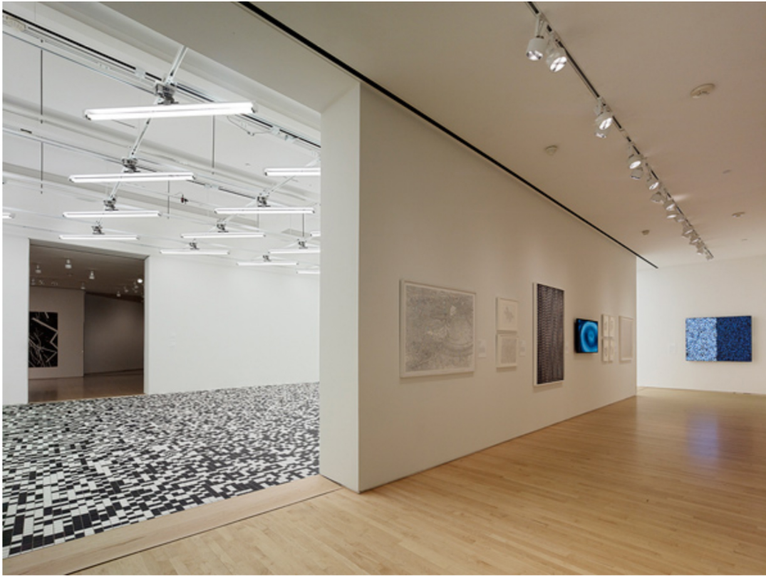
_Field Conditions_ installation view, San Francisco Museum of Modern Art, 2012