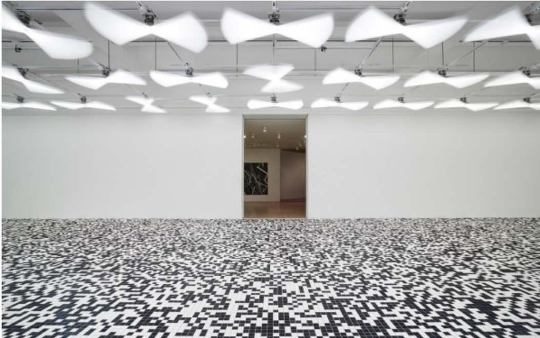
Field Conditions installation view, San Francisco Museum of Modern Art, 2012