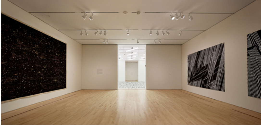
Field Conditions installation view, San Francisco Museum of Modern Art, 2012; photo: Matthew Millman