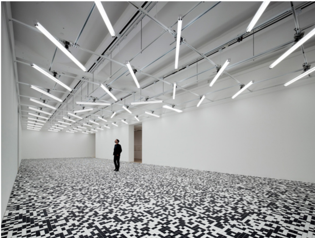
Field Conditions installation view, San Francisco Museum of Modern Art, 2012